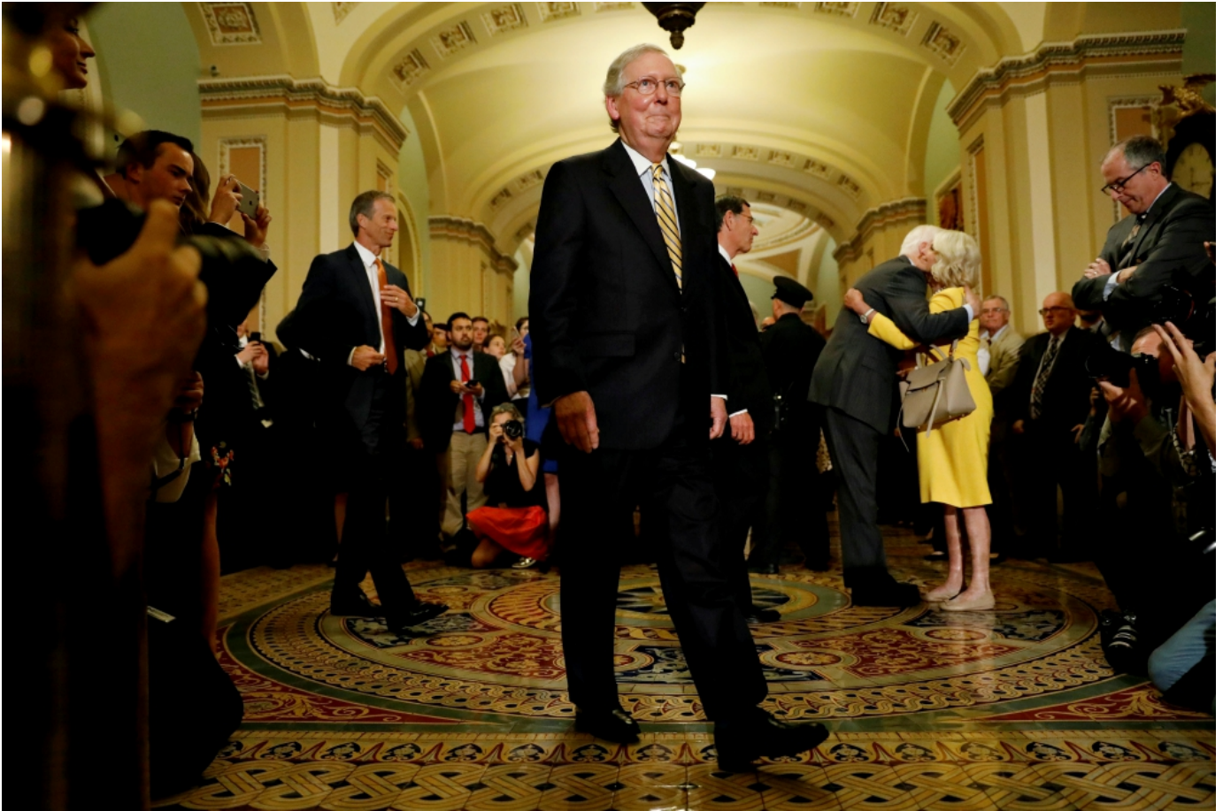
Senate Majority Leader Mitch McConnell, R-Ky., on Capitol Hill in Washington July 25

In the face of these grim realities, what are we as Catholics to think? As ever, there is wisdom to be found from the psalmist: "I will praise the Lord while I live; I will sing praises to my God while I have my being. Do not trust in princes, in mortal man, in whom there is no salvation."