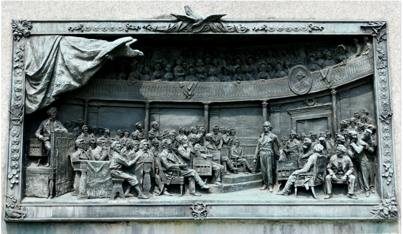
A relief on the Daniel Webster Memorial in Washington, D.C.

And the most awesome power a government possesses, the power to declare war, since the advent of the atomic bomb, presidents have wielded that power on their own, sometimes asking Congress for a vote of approval, but never for a declaration of war.