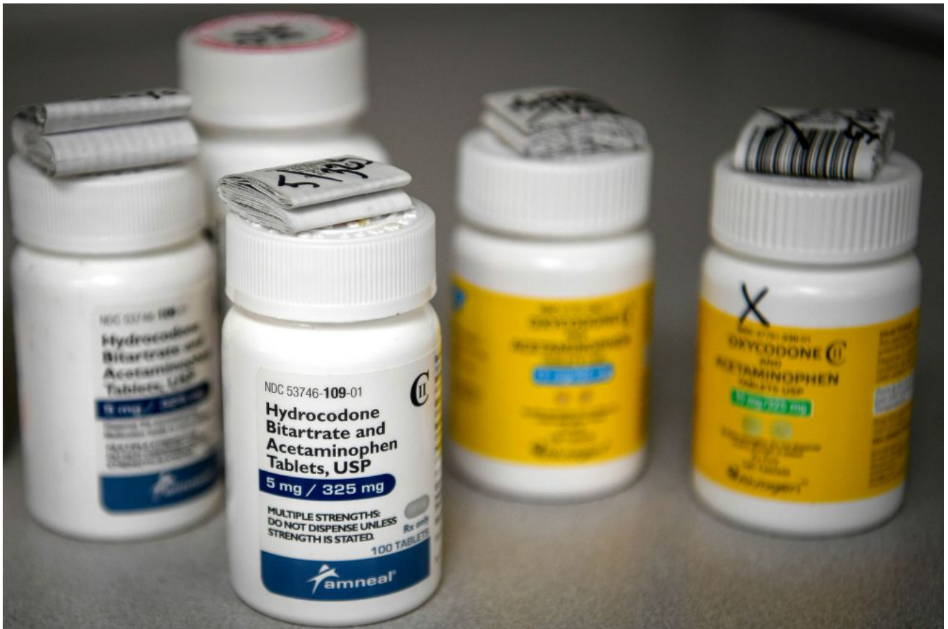
Bottles of opioid-based medication at a pharmacy in Portsmouth, Ohio

The foundation of human flourishing — dignified participation in and labor for a stable community — should be the shared basis of social life, rather than the aspirational perks of a high-powered career.