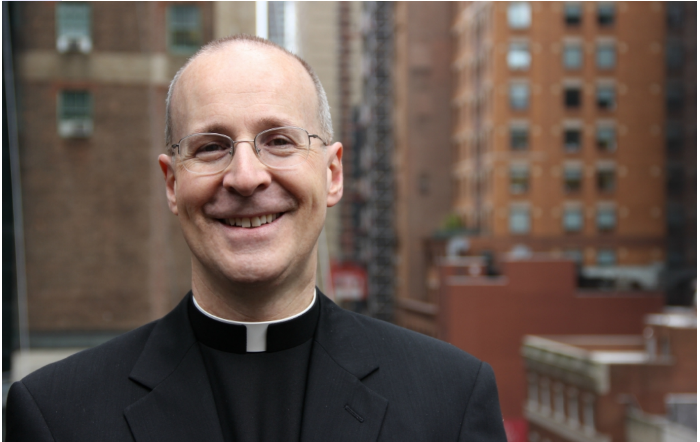
Jesuit Fr. James Martin