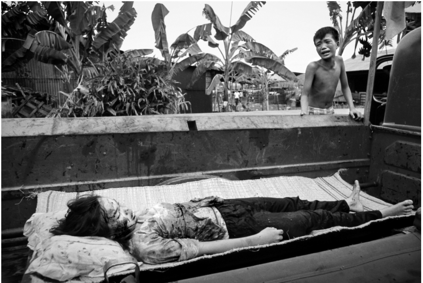
A 12-year-old girl killed in the May Offensive (Mini-Tet), 1968, in Saigon

Fifty years later, the slogan at the time, "Better dead than red," makes no sense at all. The war makers are almost all dead; former combatants are now friends. The viewer is left wondering, "Can this kind of madness ever end?"