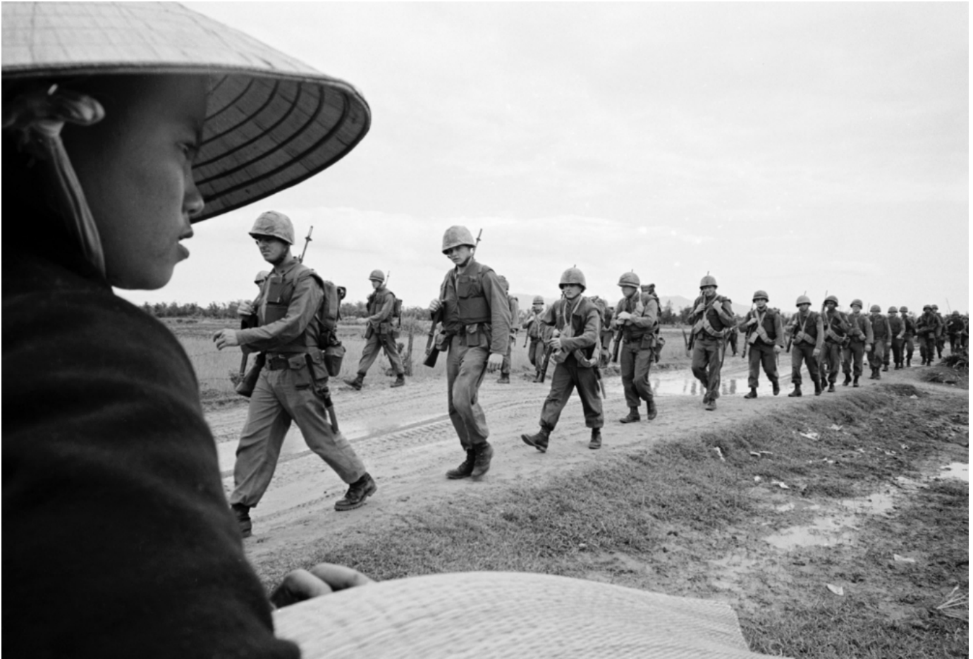
Marines marching in Danang, Vietnam, March 15, 1965