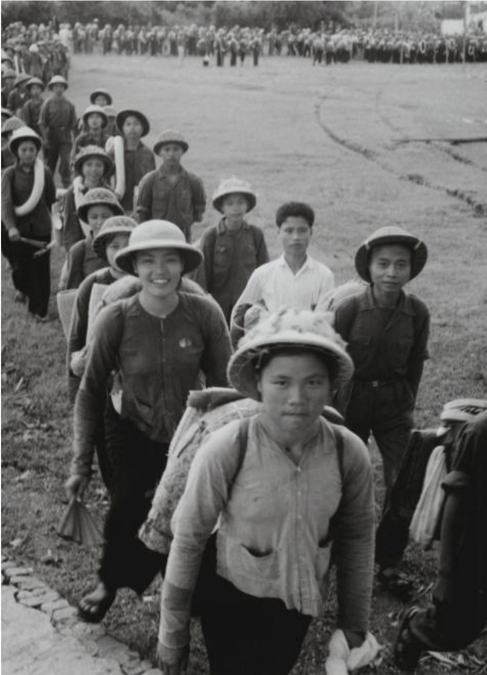
Young North Vietnamese join the Youth Shock Brigades Against the Americans for National Salvation.