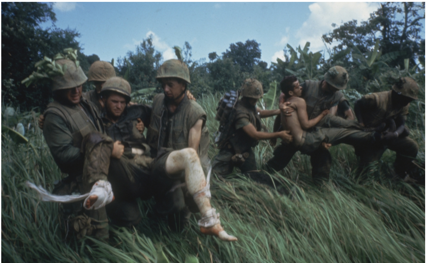
Marines carrying their wounded during firefight near the DMZ, 1966.