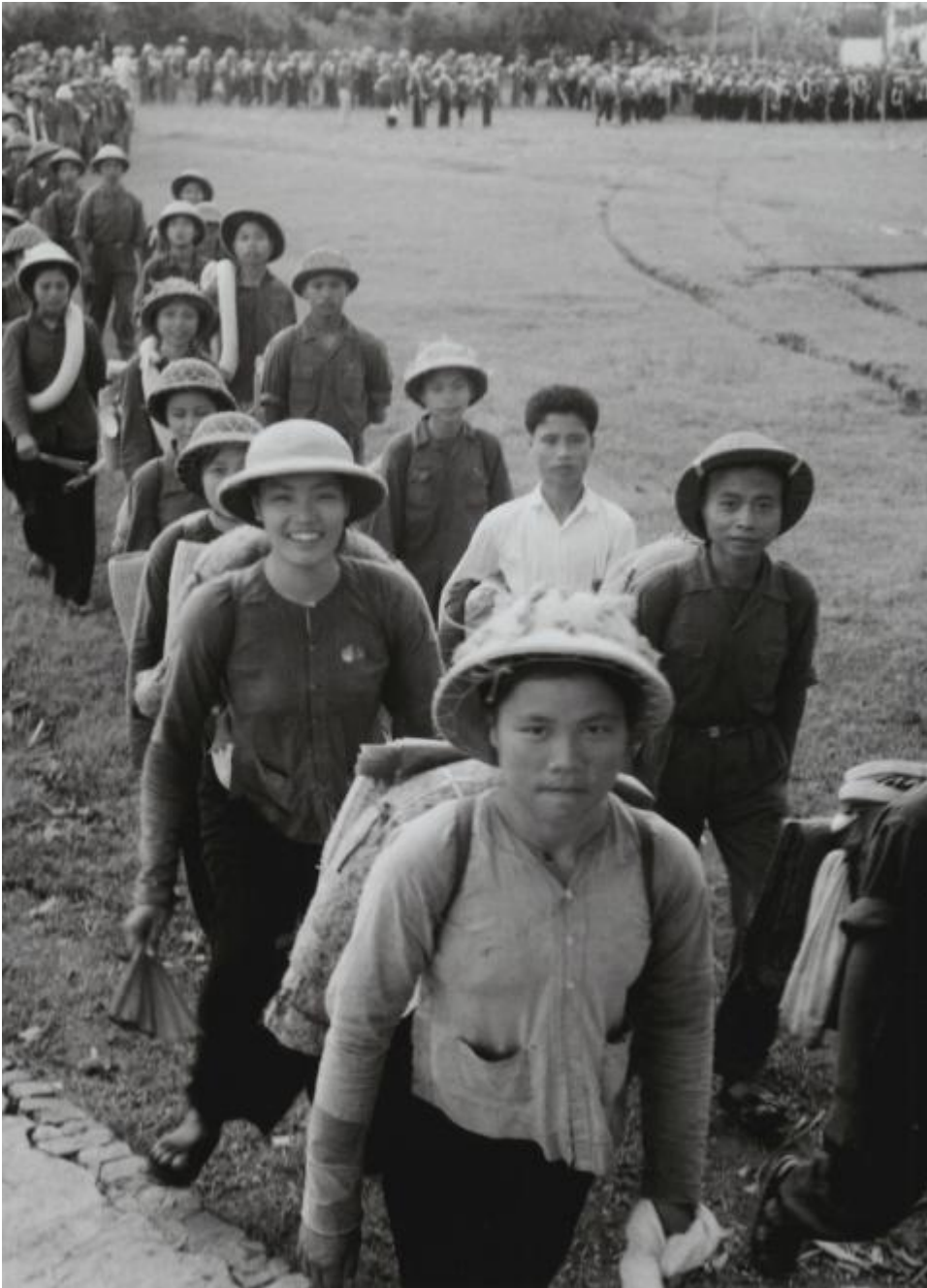
Young North Vietnamese join the Youth Shock Brigades Against the Americans for National Salvation.