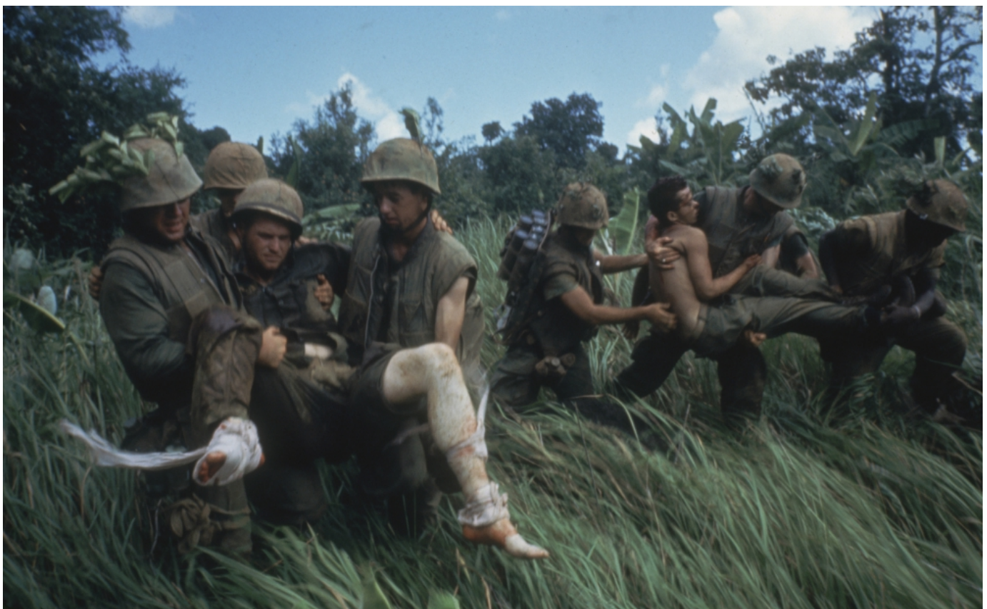
Marines carrying their wounded during firefight near the DMZ, 1966.