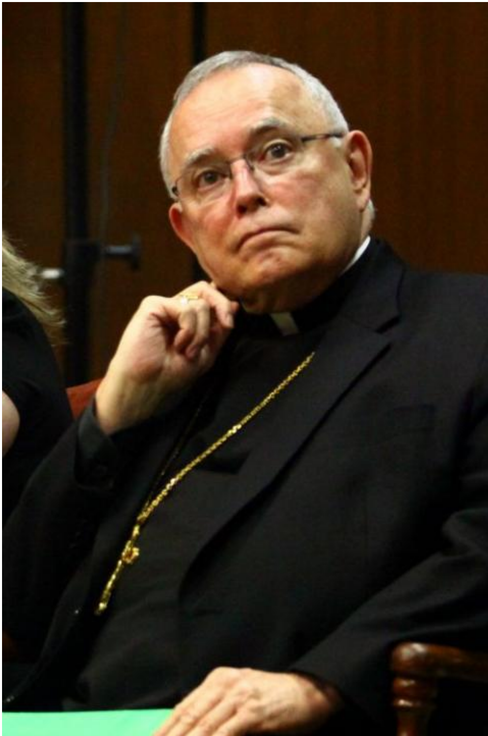
Bishop Charles Chaput of Philadelphia is pictured at an Oct. 3, 2016, news conference.

"The bitterness directed at the person of Fr. Martin is not just unwarranted and unjust; it's a destructive counter-witness to the Gospel," Chaput said. He called Martin "a man of intellect and skill whose work I often admire."