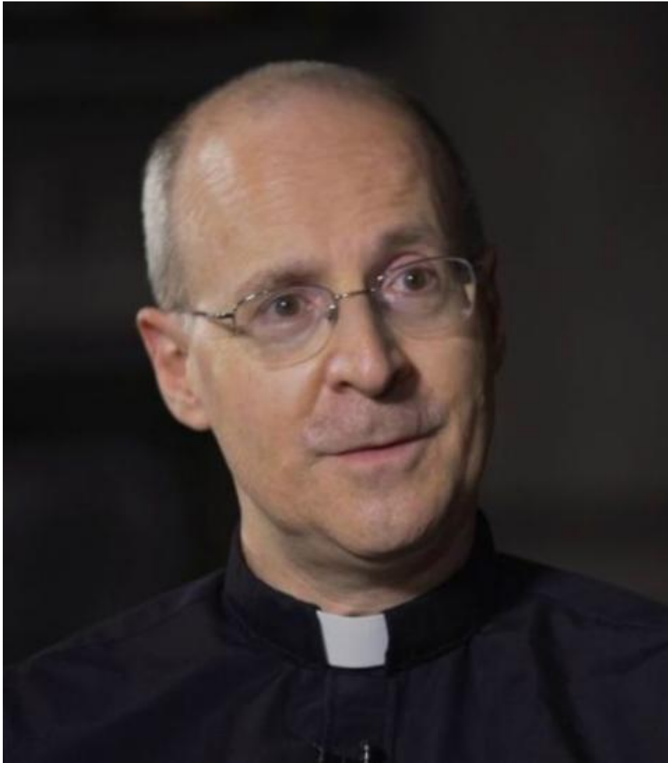
Jesuit Fr. James Martin

The seminary, part of the Catholic University of America, which was founded by the U.S. bishops in 1887 and carries a papal charter, said in a statement sent to alumni Sept. 15 it made the decision in an attempt to avoid distraction and controversy during the centennial anniversary, after it "experienced increasing negative feedback from various social media sites."