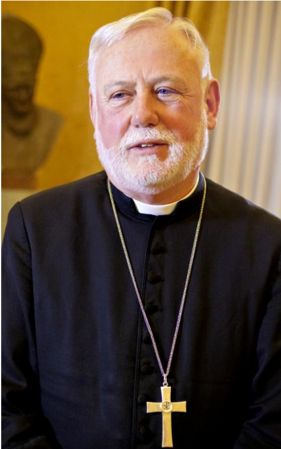
Archbishop Paul Gallagher

Archbishop Paul Gallagher, Vatican foreign minister, signed the treaty at the United Nations Sept. 20. The treaty would enter into force 90 days after at least 50 countries both sign and ratify it. As of Sept. 25 , 53 countries have signed and three