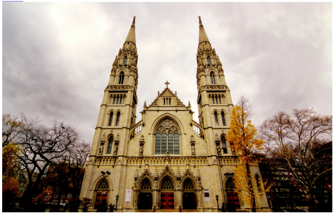
St. Paul Cathedral in Pittsburgh