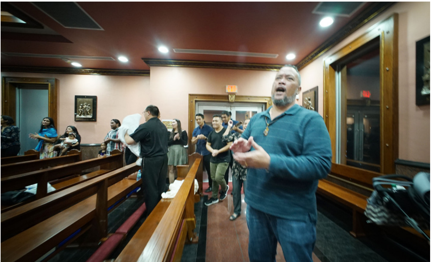
Celebrants sing, dance and play music joyfully during a lively Neocatechumenal Way service in Hagatña.

The orchestrated nature of the allegations against Apuron helps fuel the doubt, especially among followers of the Neocatechumenal Way who feel scapegoated.