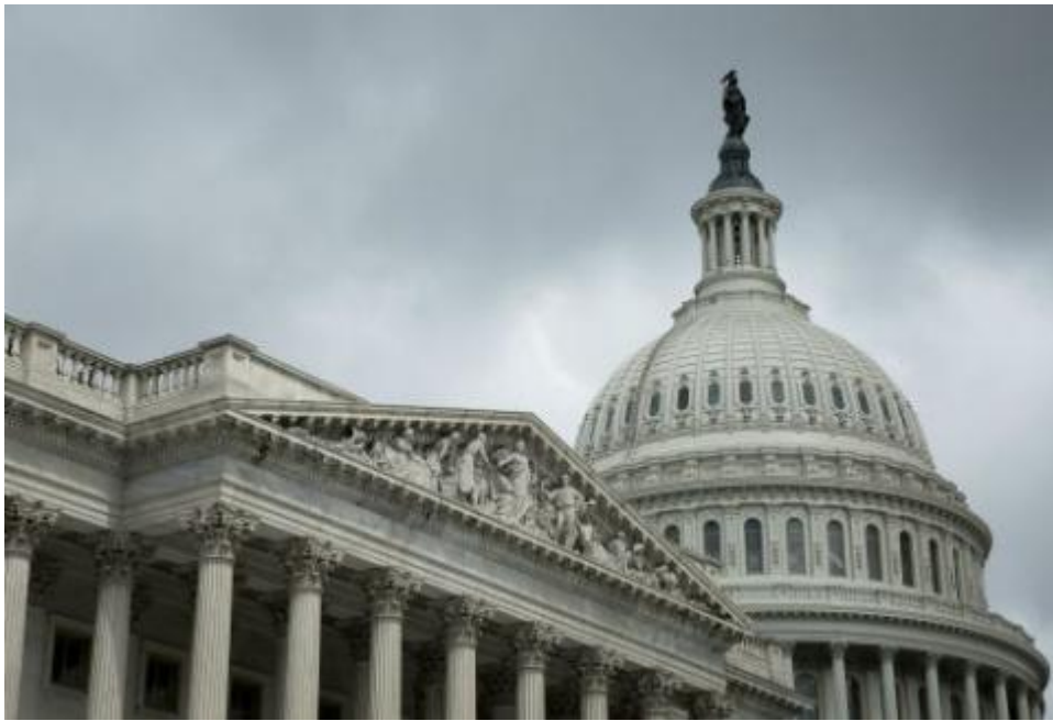
The U.S. Capitol in Washington

The extent of the alliance between Buchanan's mind and Koch's money takes several chapters to tell. I do not want to give the whole story away — I want you to buy the book, read it, and share it with a friend. But if you think this is just all so much interesting, albeit scary, history, think again. Think of the crisis in Flint, Michigan, a direct outgrowth of the Koch-funded Mackinac Center, which first began the push for state-appointed city managers with no accountability to the electorate. Think of the disinformation campaign about climate change and its success: "The number of Americans who believed that 'continued burning of fossil fuels would alter the climate' dropped from 71 percent in 2007 to 44 percent in 2011." Think of the efforts to suppress voter participation that have created a fake issue — voter fraud — to justify restrictions on the franchise that disproportionately harm the poor. Through the American Legislative Exchange Council and the State Policy Network, both funded by Koch, the radical vision of a polity organized not around shared rights of citizenry but around property rights made sacrosanct is being implemented from Wisconsin to North Carolina. And their special focus on races for judgeships may be the least noticed, but most consequential, direct involvement in electoral politics.