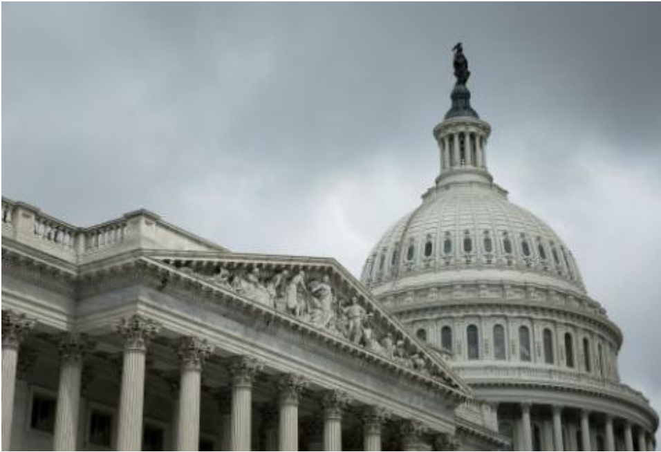
The U.S. Capitol in Washington

The extent of the alliance between Buchanan's mind and Koch's money takes several chapters to tell. I do not want to give the whole story away — I want you to buy the book, read it, and share it with a friend. But if you think this is just all so much interesting, albeit scary, history, think again. Think of the crisis in Flint, Michigan, a direct outgrowth of the Koch-funded Mackinac Center, which first began the push for state-appointed city managers with no accountability to the electorate. Think of the disinformation campaign about climate change and its success: "The number of Americans who believed that 'continued burning of fossil fuels would alter the climate' dropped from 71 percent in 2007 to 44 percent in 2011." Think of the efforts to suppress voter participation that have created a fake issue — voter fraud — to justify restrictions on the franchise that disproportionately harm the poor. Through the American Legislative Exchange Council and the State Policy Network, both funded by Koch, the radical vision of a polity organized not around shared rights of citizenry but around property rights made sacrosanct is being implemented from Wisconsin to North Carolina. And their special focus on races for judgeships may be the least noticed, but most consequential, direct involvement in electoral politics.