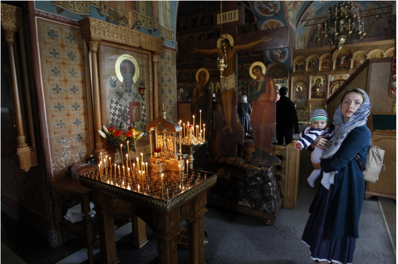
A young Russian Orthodox woman holds her child in a church at Optina Monastery May 27.