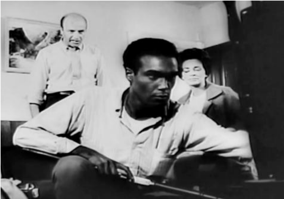
Duane Jones, center, as lead character Ben in George Romero's 1968 film "Night of the Living Dead"

Those darker impulses echo original sin, he claims, but they also serve as foils to other characters, who recall the good Samaritan and his willingness to help others despite his personal safety. If the appearance of zombies is understood to represent the Fall, those good Samaritans provide some hope for redemption, both within the narrative and in the real, tumultuous world.