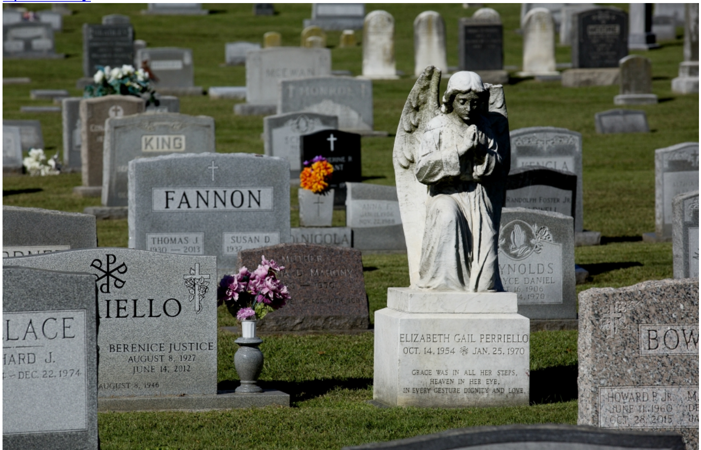
St. Mary Parish's cemetery in Alexandria, Virginia