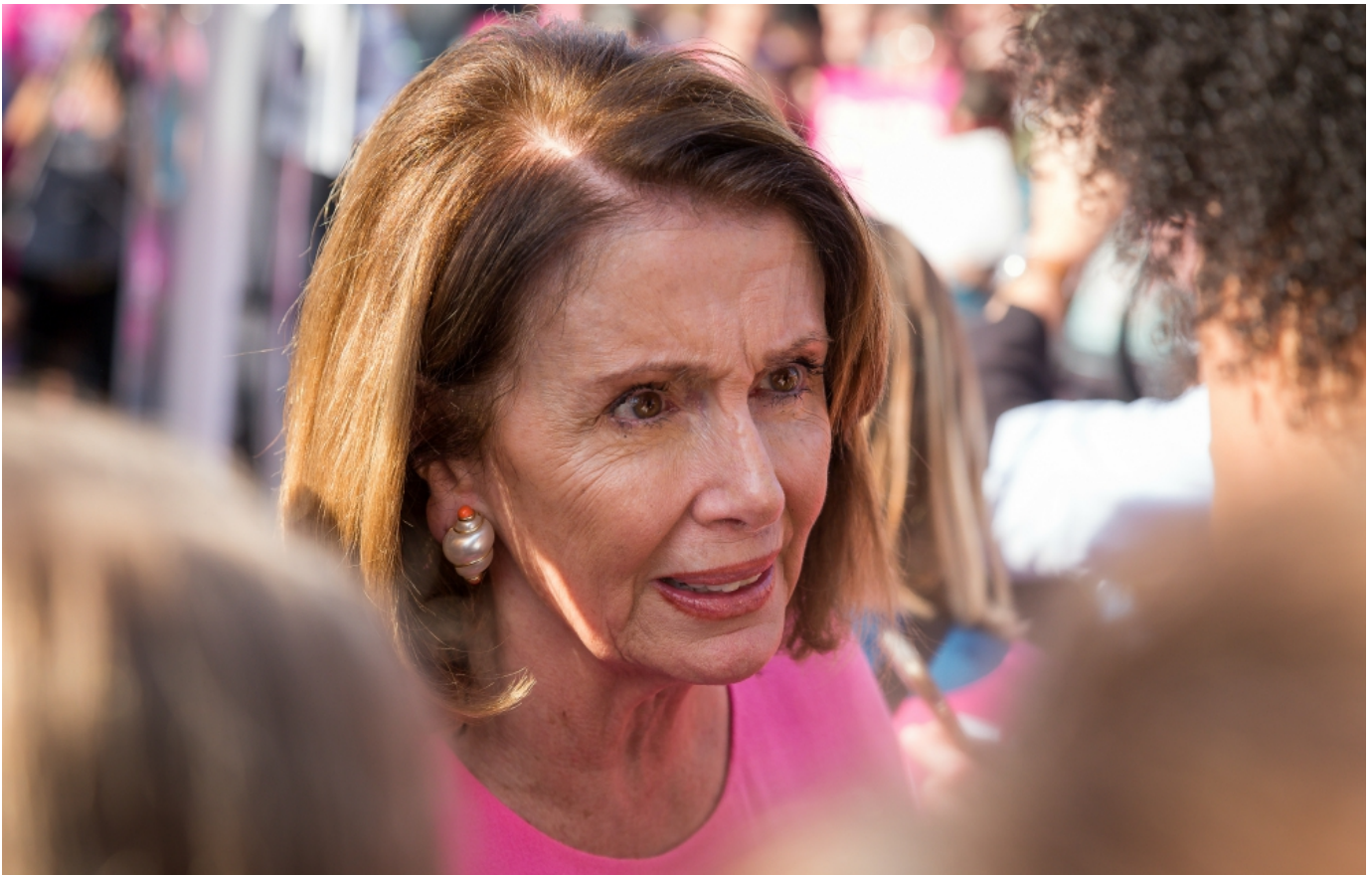
Minority Leader Nancy Pelosi attends a rally to defend the Affordable Care Act at the U.S. Capitol in Washington, D.C., June 28.

Her No. 2 is Congressman Steny Hoyer, who has been in Congress even longer, since 1981. Pelosi represents San Francisco and Hoyer represents the suburbs of Washington, D.C., not exactly Middle America.