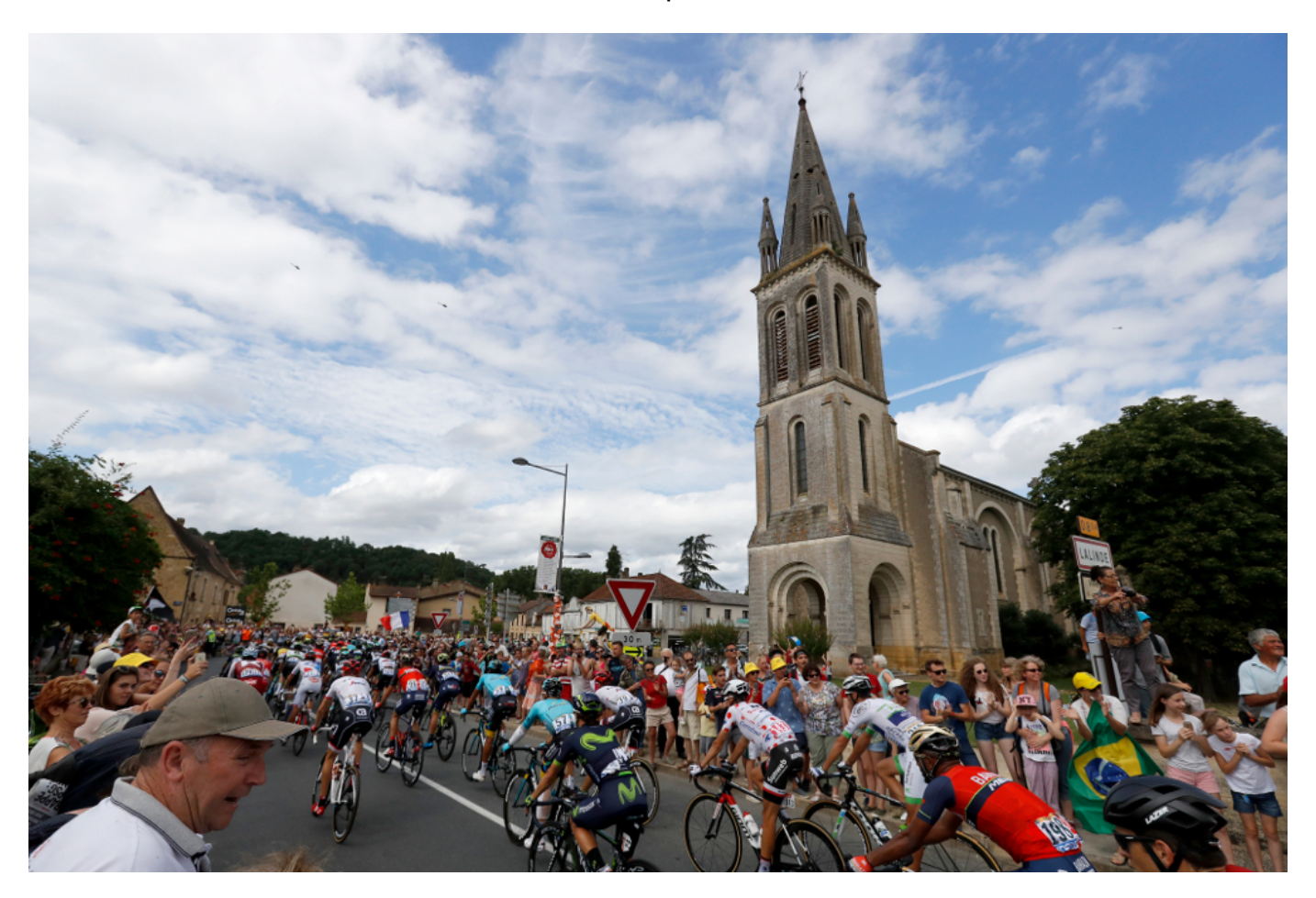
Riders pass St. Pierre Catholic Church during the 10th stage of the 104th Tour de France cycling race July 11 in Lalinde.

Meanwhile, some dioceses have also loaned or given unused places of worship to Orthodox churches, which have also expanded rapidly in Western Europe with post-communist immigration. Russia's Orthodox Church alone has set up over 400 parishes in 52 countries since the Soviet Union collapsed in 1991 and plans to build its own cathedrals and basilicas in cities ranging from Madrid in Spain to Nicosia in Cyprus. In Paris, a massive new Russian Orthodox cathedral and culture center were dedicated on the Quai Branly in October 2016, after the church's Western Korsun Diocese outbid Saudi mosque builders for the site.