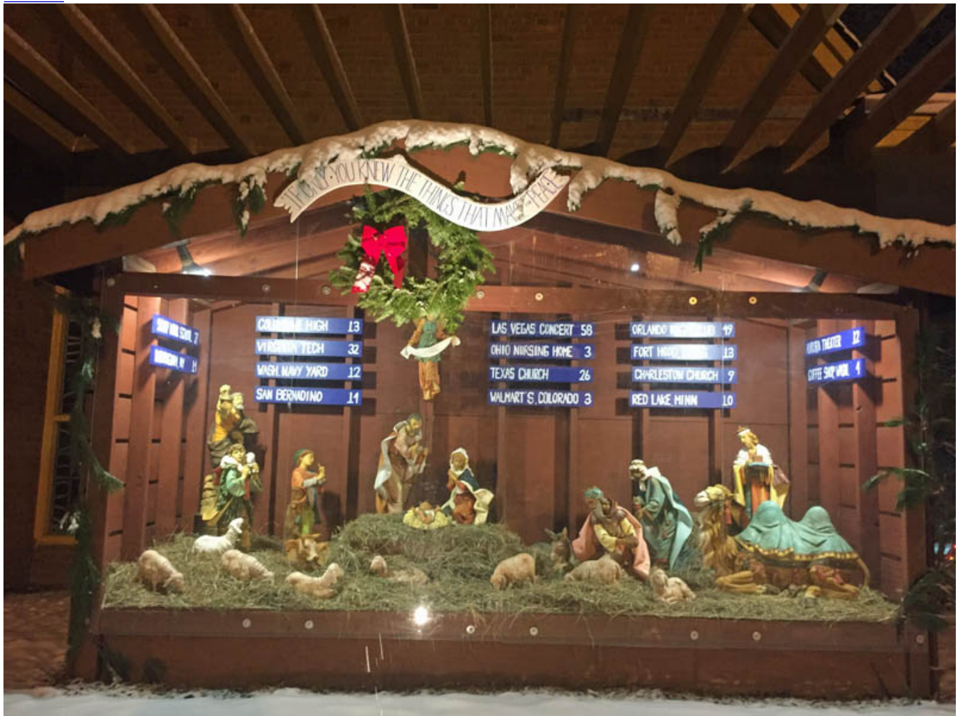
St. Susanna Parish's Nativity scene