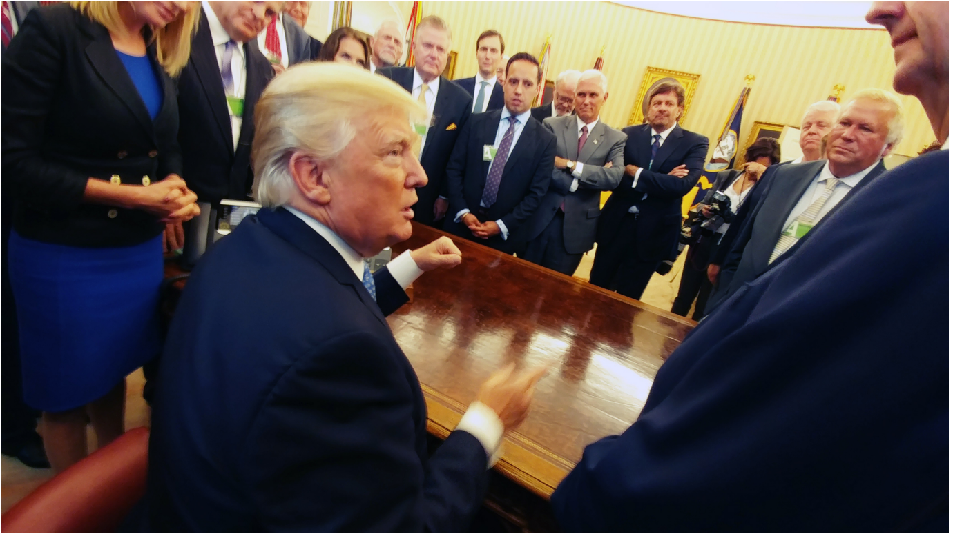
President Trump meets with faith leaders inside the Oval Office on July 10, 2017.

2018 will likely see white evangelical Protestants remaining locked in for Republican candidates in the midterm elections. According to the exit polls, 81 percent of white evangelical Protestant voters pulled the lever for Donald Trump in the 2016 presidential election, and they strongly supported the president throughout his first year in office.