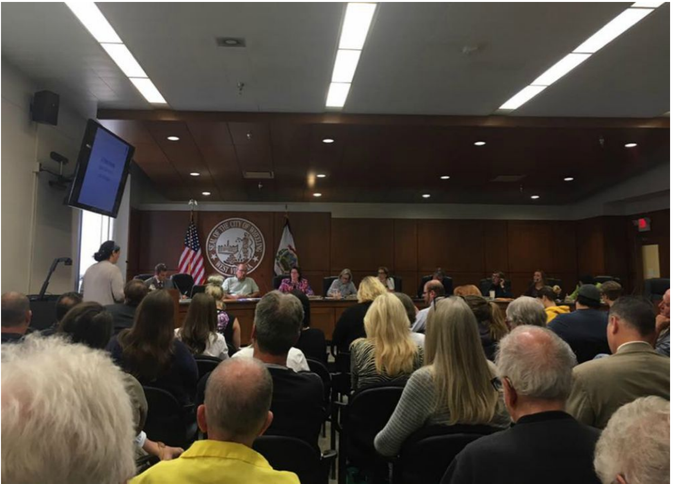
Wheeling, West Virginia Planning Commission meeting Sept. 11, 2017