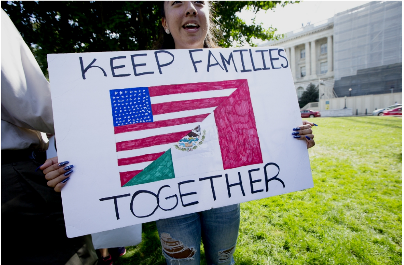
A participant at an immigration rally is seen near the U.S. Capitol in Washington Sept. 26, 2017.