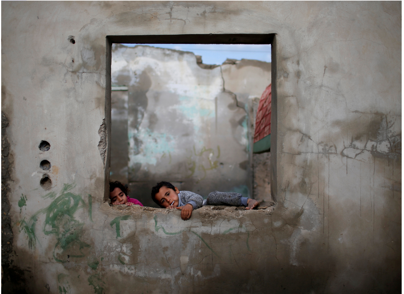
Palestinian children play in the Al-Shati refugee camp in Gaza City Jan. 15.