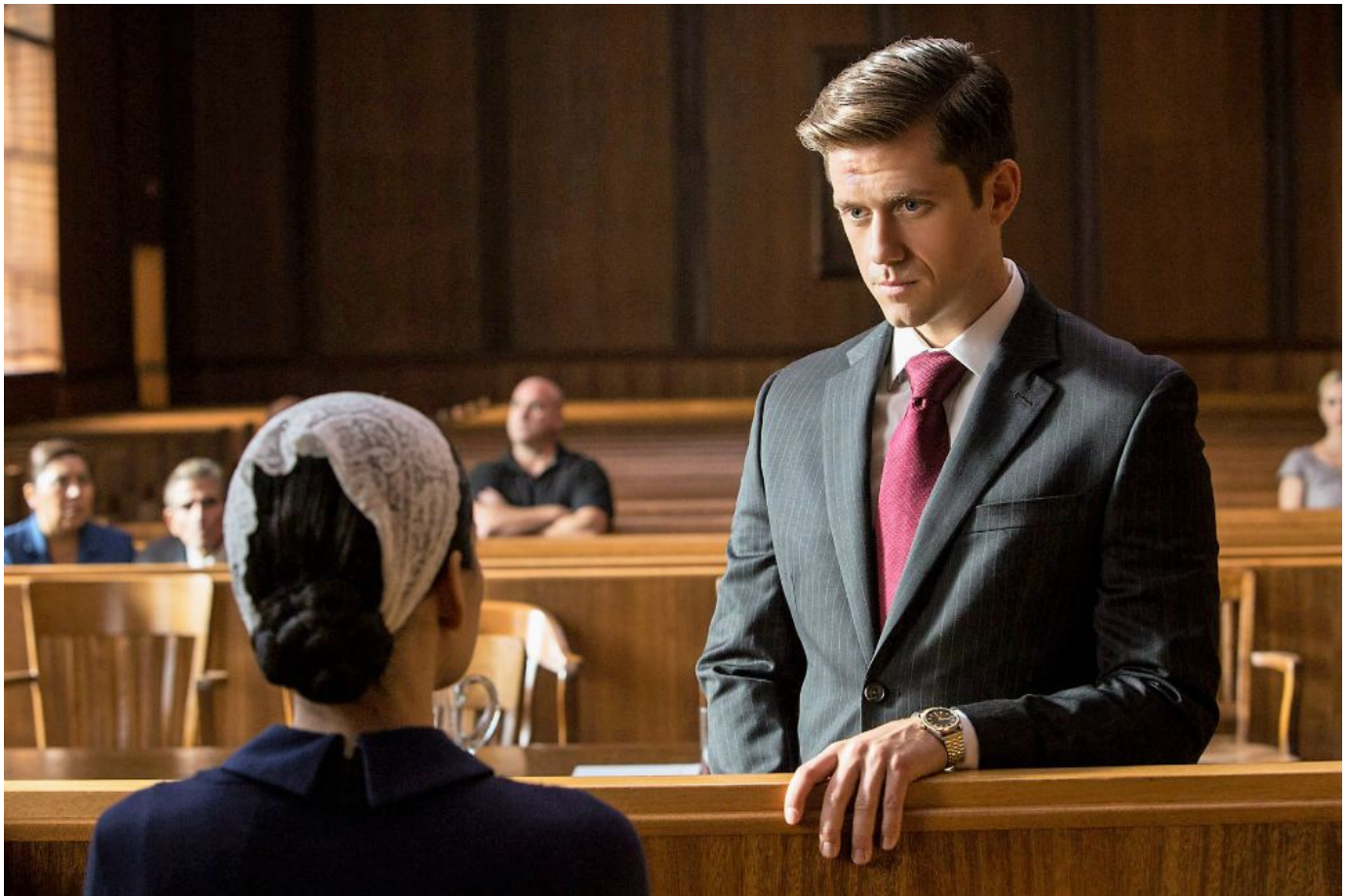
Edy Ganem, left, as Alejandra Batista, with Aaron Tveit as Tommy Reilly in "Created Equal" (Vision Films)