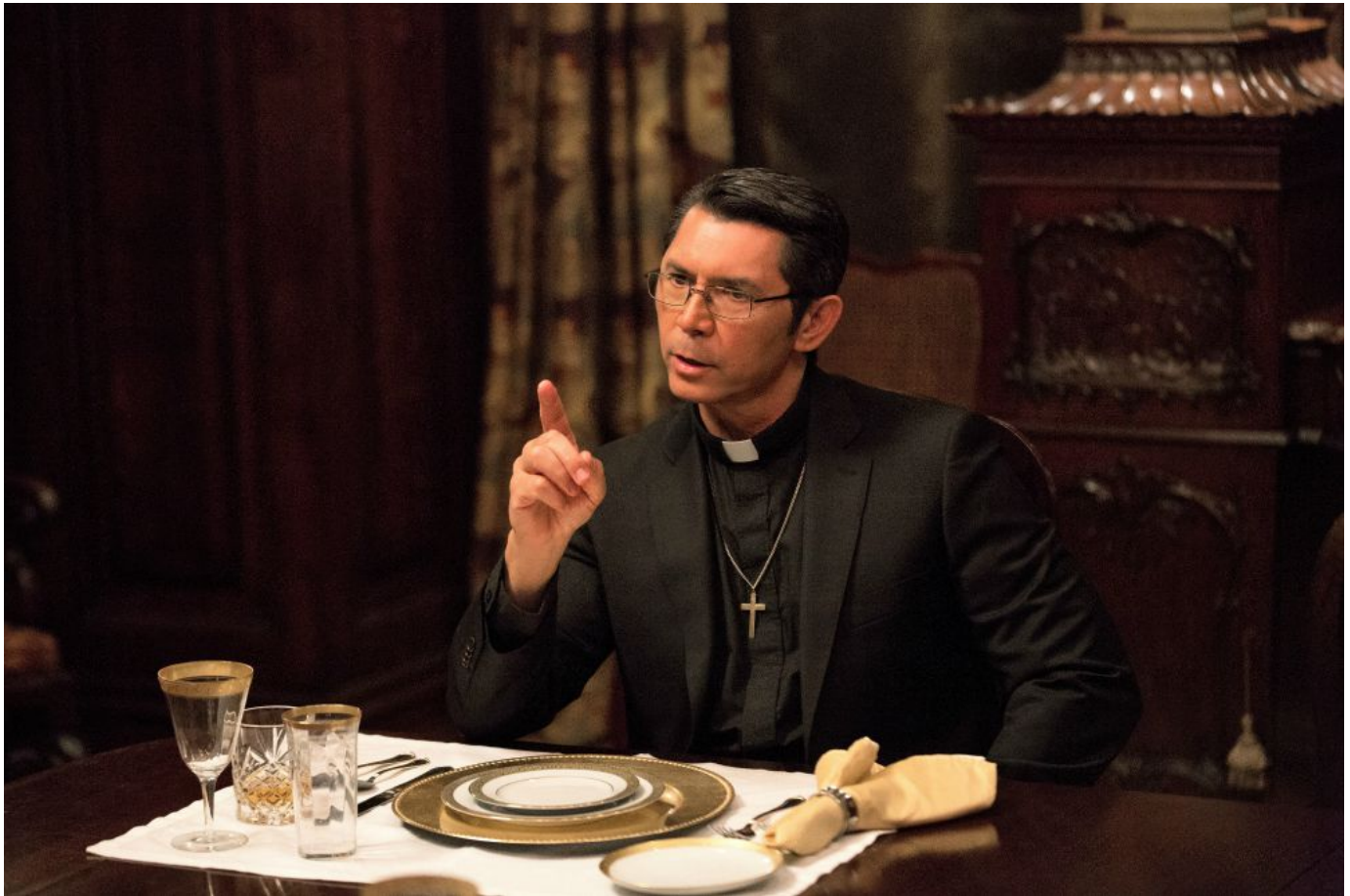
Lou Diamond Phillips

Although the film's production occurred before the start of the #MeToo and #TimesUp movement, the cast is happy to contribute to the larger discussion.