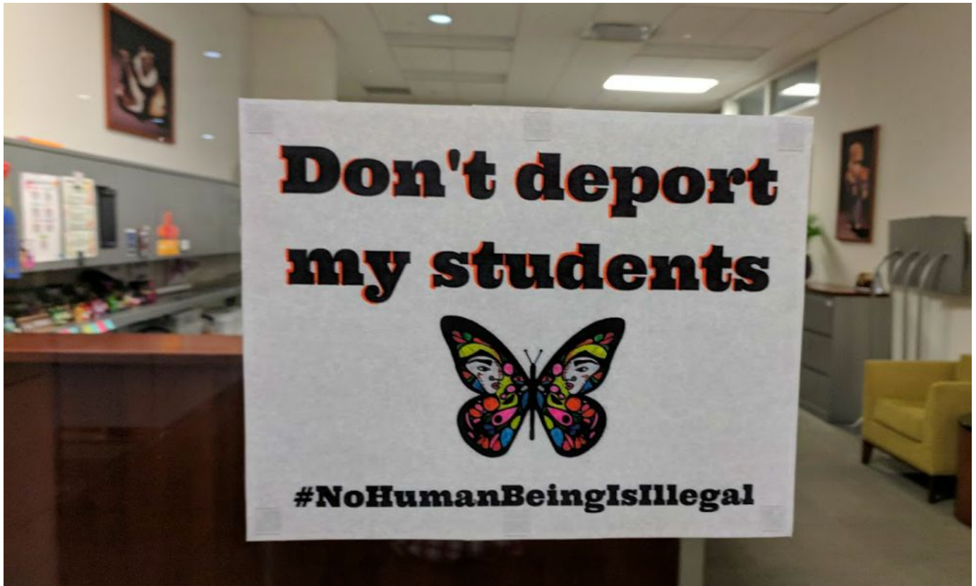
A poster at the library at Loyola Marymount University