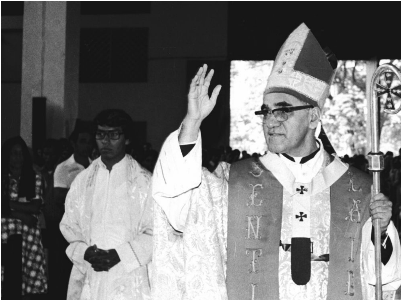
Blessed Óscar Romero is seen in an undated photo.

Romero's canonization comes at a time of incredible violence in the world. Pope Francis has spoken about a third world war, fought piecemeal. What message do you think Romero's sainthood gives to the world about the Christian witness of nonviolence?