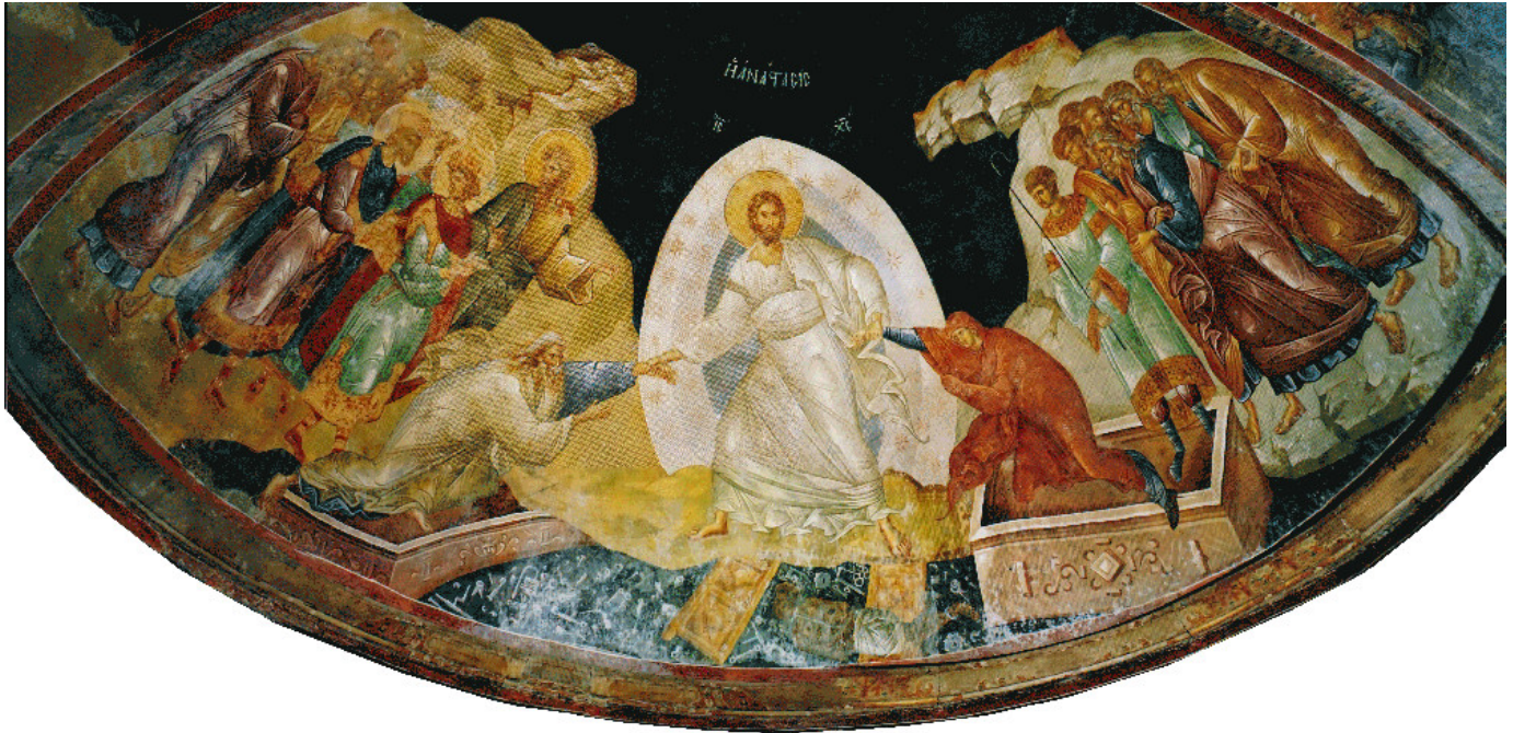
Image of anastasis, or Resurrection, inside of Chora Church Mosque Museum, in Istanbul, Turkey (Sarah Sexton Crossan)