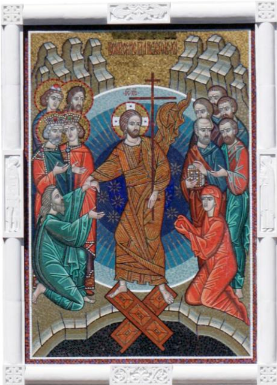
Image of anastasis, or Resurrection, on Resurrection Gate, inside Red Square, in Moscow, Russia (Sarah Sexton Crossan)

was overcome by what it did not see. ... Christ is risen, and the tomb is emptied of the dead.