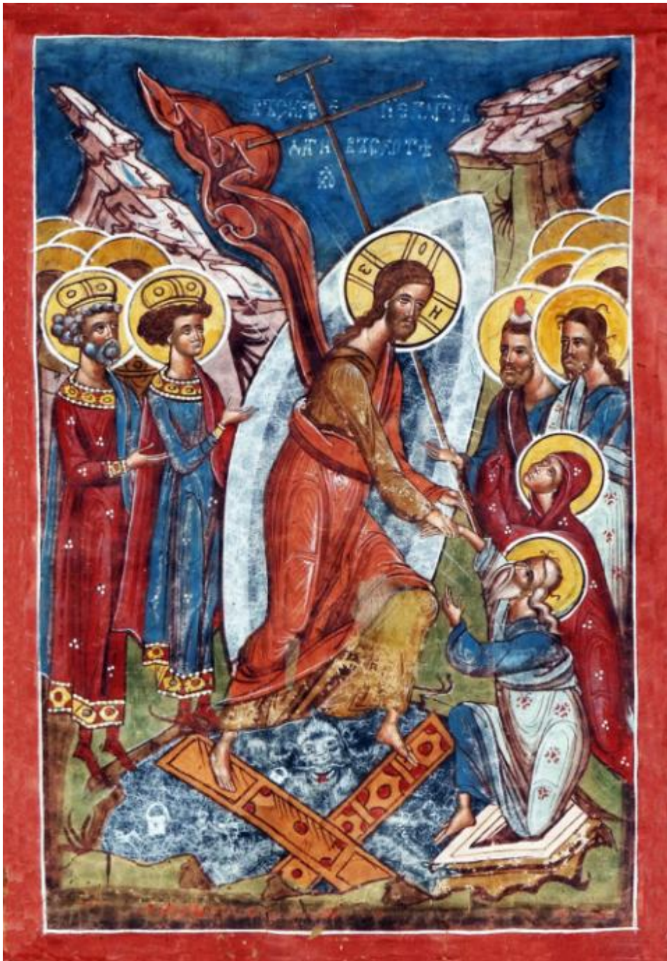
Image of anastasis, or Resurrection, outside of the Church of St. George at the Voronet Monastery in Gura Humorului, Romania

This question set off a quest that ranged along Byzantium's Greek Tiber, the Syriac Tigris, the Russian Neva and the Coptic Nile. The duo made 20 research trips over the course of 15 years to document images and collect information about extant versions of Christ's resurrection, although the authors prefer to use the Greek word anastasis , which literally means "up-rising."