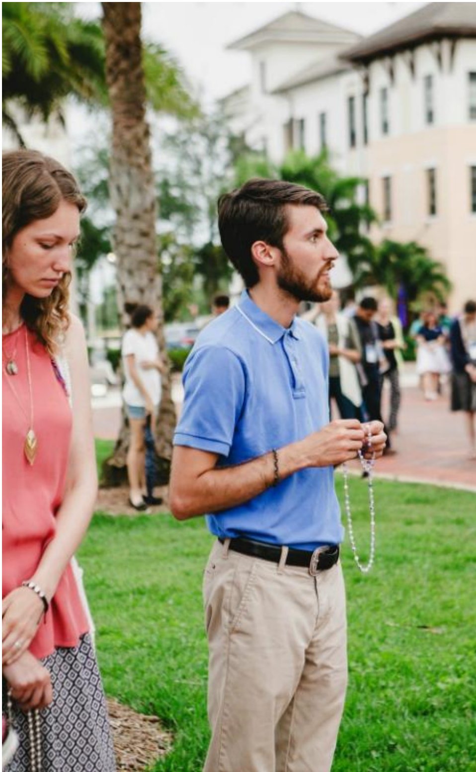
Missionaries with FOCUS pray the rosary during a June 13, 2017, procession in Ave Maria, Florida.