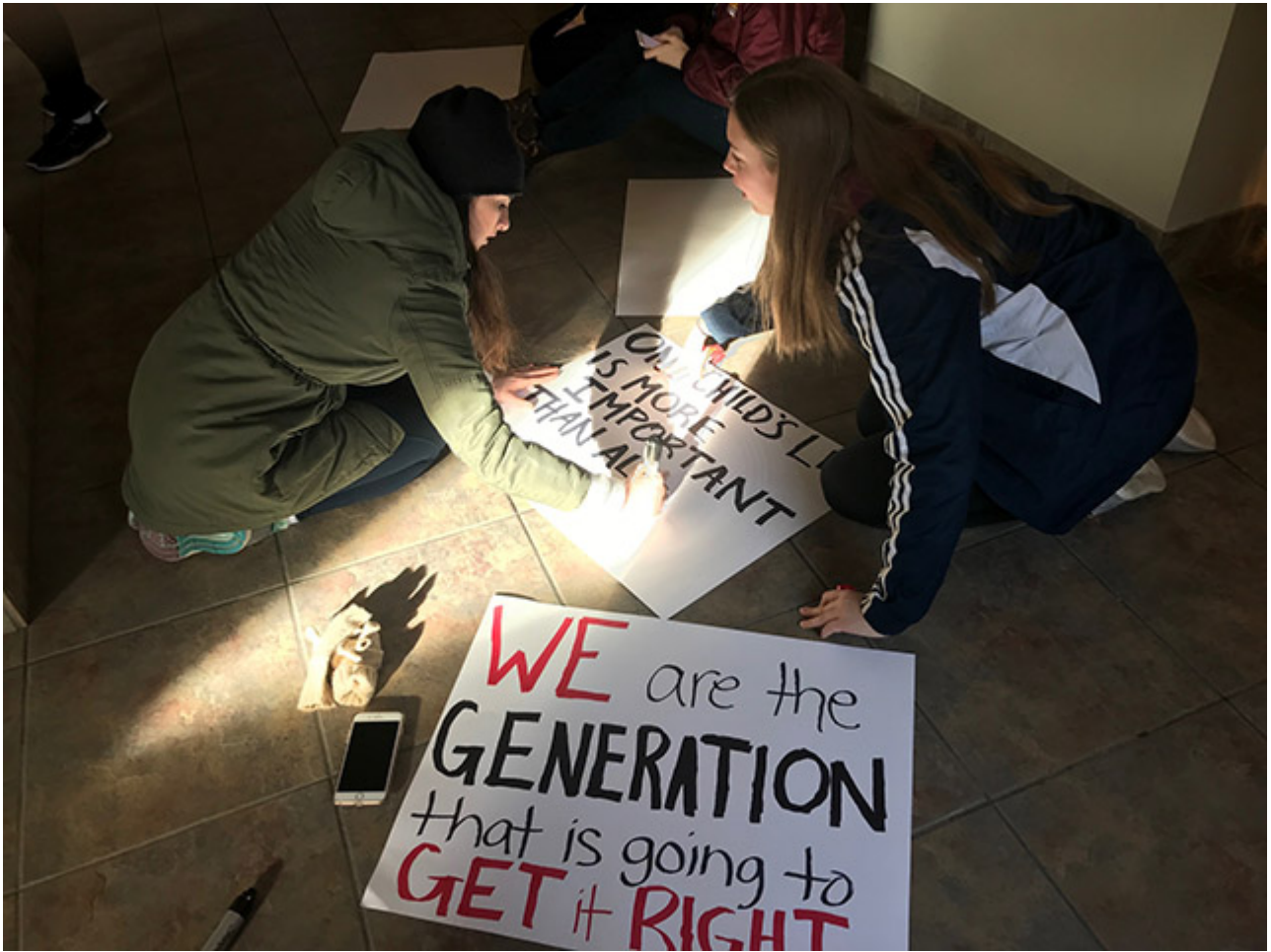
Two Students from St. Joseph Academy prepare signs for the march against gun violence in Cleveland. (Christine Schenk)