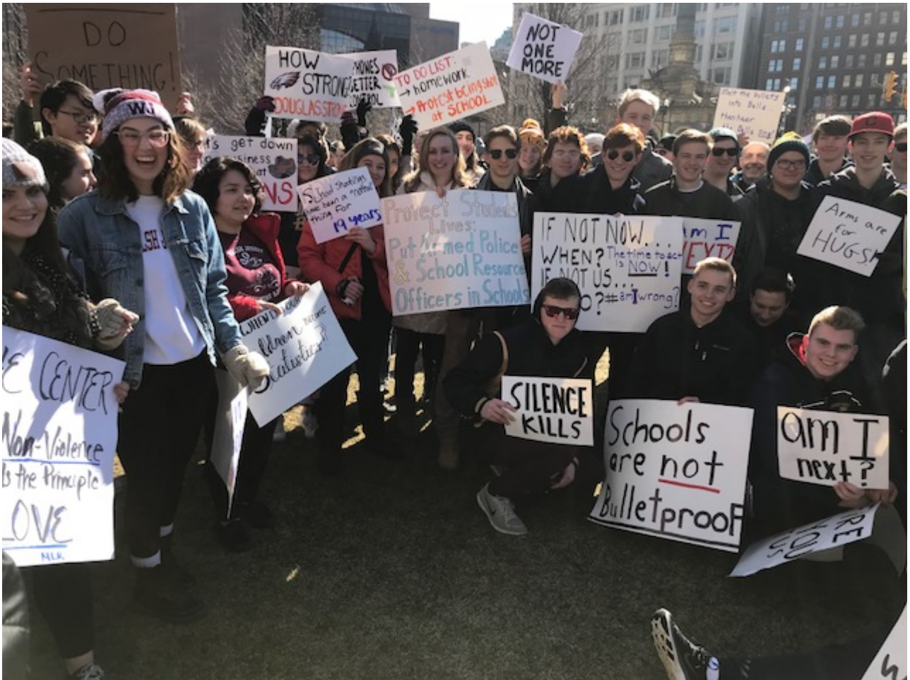
At least 100 Students from Cleveland Catholic schools, including St. Ignatius, St. Joseph Academy, Beaumont, Cleveland Central Catholic, Walsh Jesuit (in Akron), and Magnificat march against gun violence. (Christine Schenk)