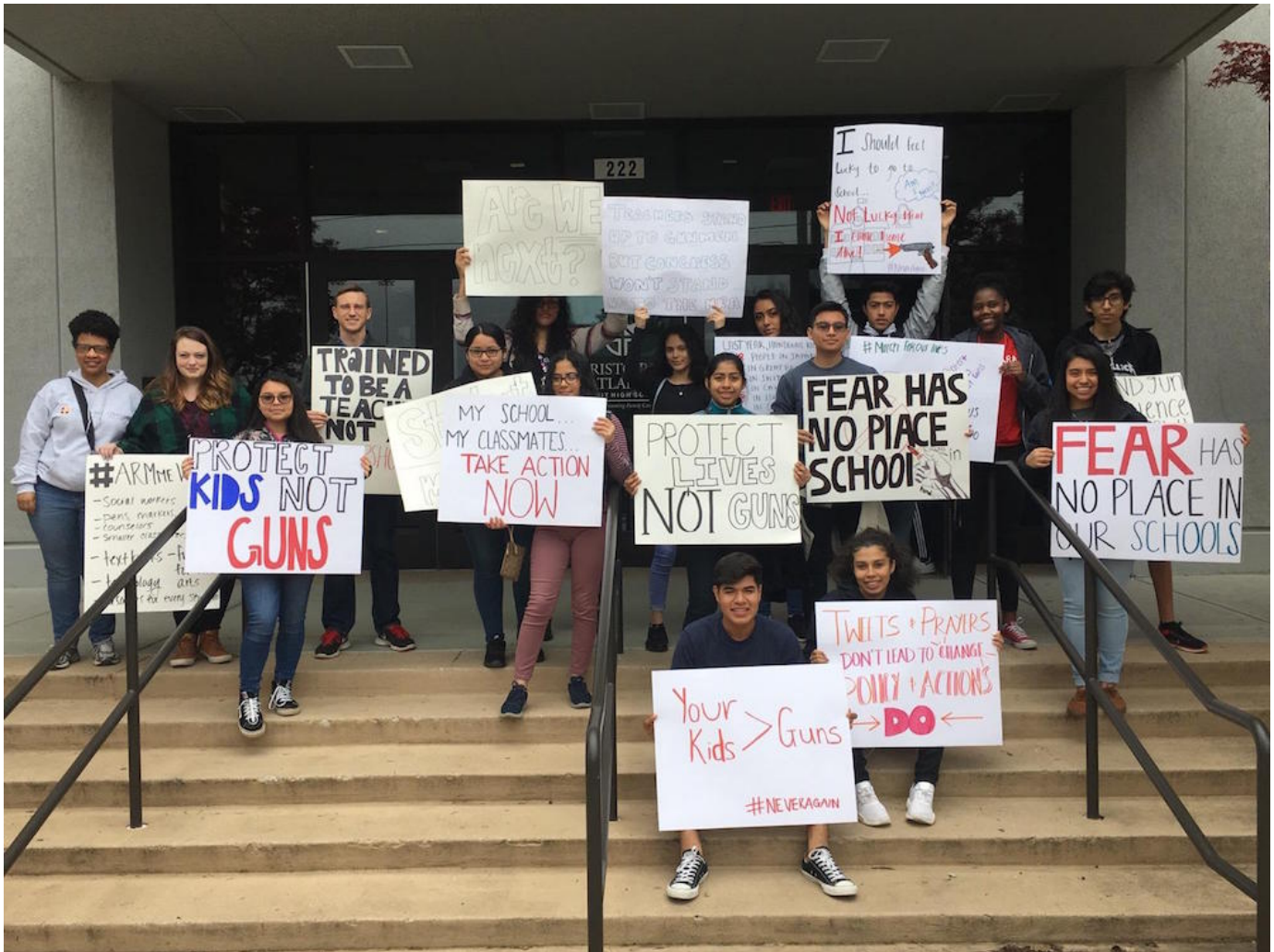
Students at Cristo Rey Atlanta Jesuit High School show the posters they made for March for Our Lives.

On Saturday, they carried their signs again among an estimated 30,000 people through downtown Atlanta. The route took the marchers from the Center of Civil and Human Rights to Liberty Plaza near the state capitol building. U.S. Rep. John Lewis, who had marched with Martin Luther King Jr. in Selma, Alabama, in 1965 was among the day's speakers.