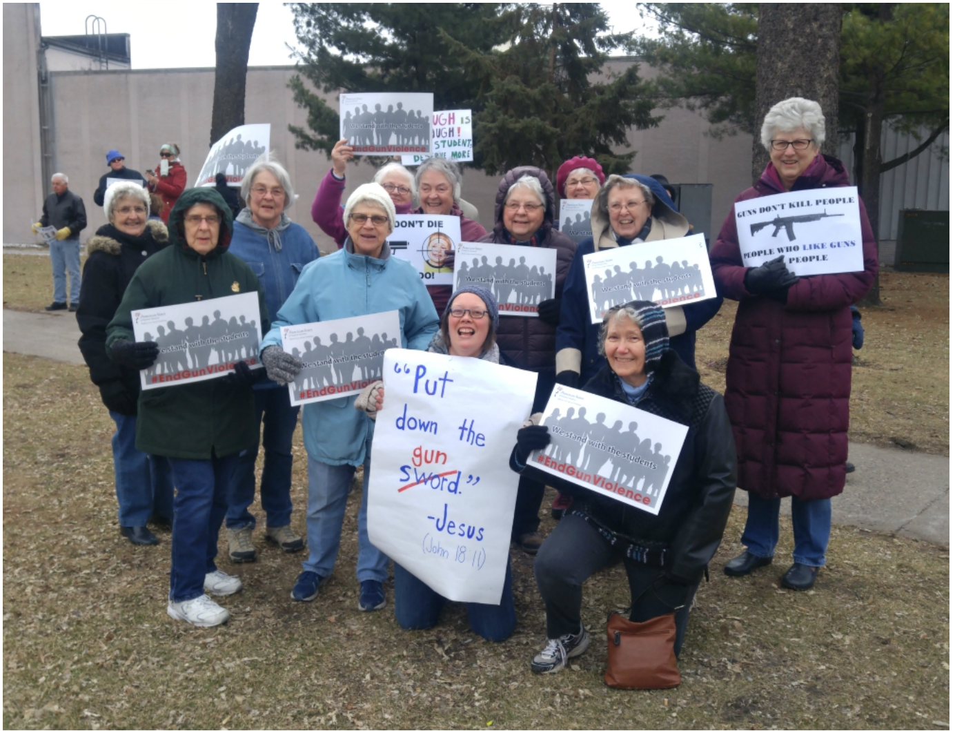
Franciscan Sisters of Perpetual Adoration gather at the downtown March for Our Lives in La Crosse, Wisconsin, while another group of the sisters march in solidarity with the students at St. Rose Convent, the congregational motherhouse across town.