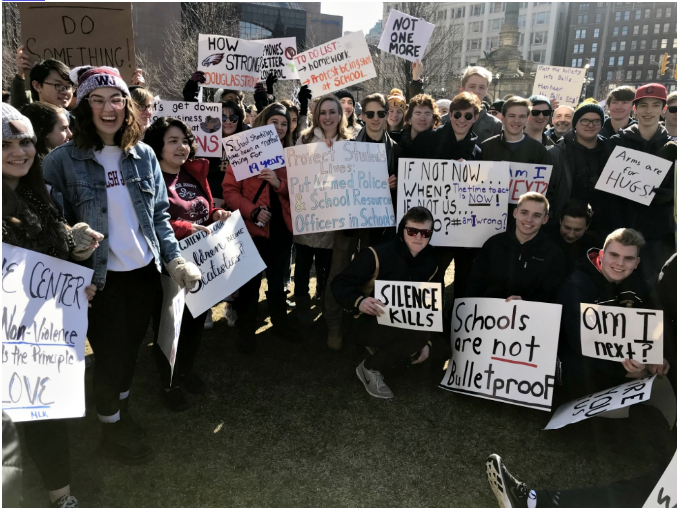
More than a hundred students and faculty from Northeast Ohio Catholic high schools attended the March for Our Lives in Cleveland Public Square on March 24.