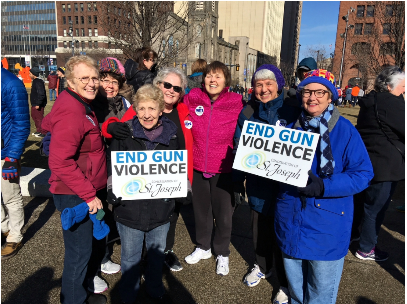
Cleveland Congregation of St. Joseph sisters march to end gun violence March 24.