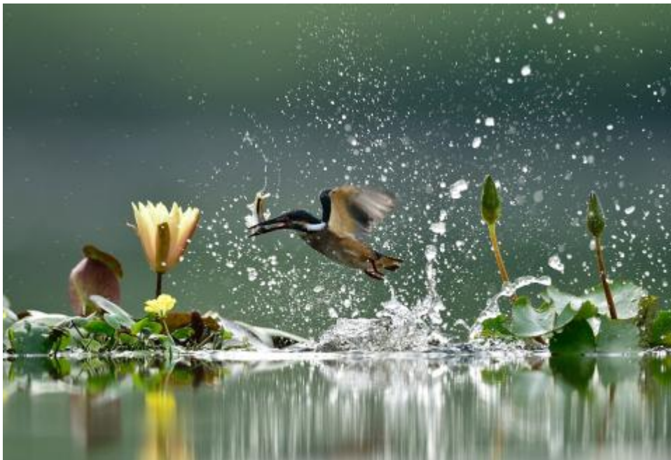
A kingfisher catches a fish in Guri, South Korea.