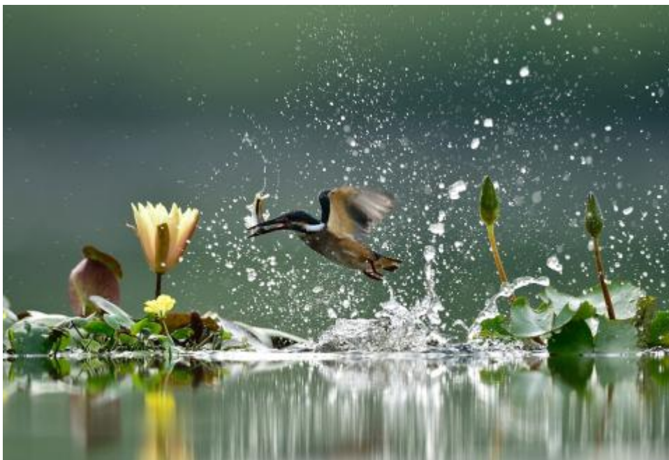
A kingfisher catches a fish in Guri, South Korea.