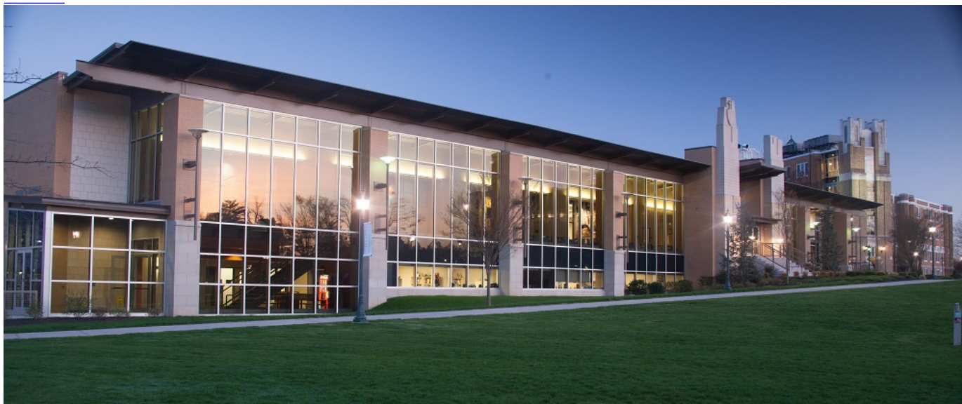
Sandy and Marlene Insalaco Hall on the campus of Misericordia University in Dallas, Pennsylvania