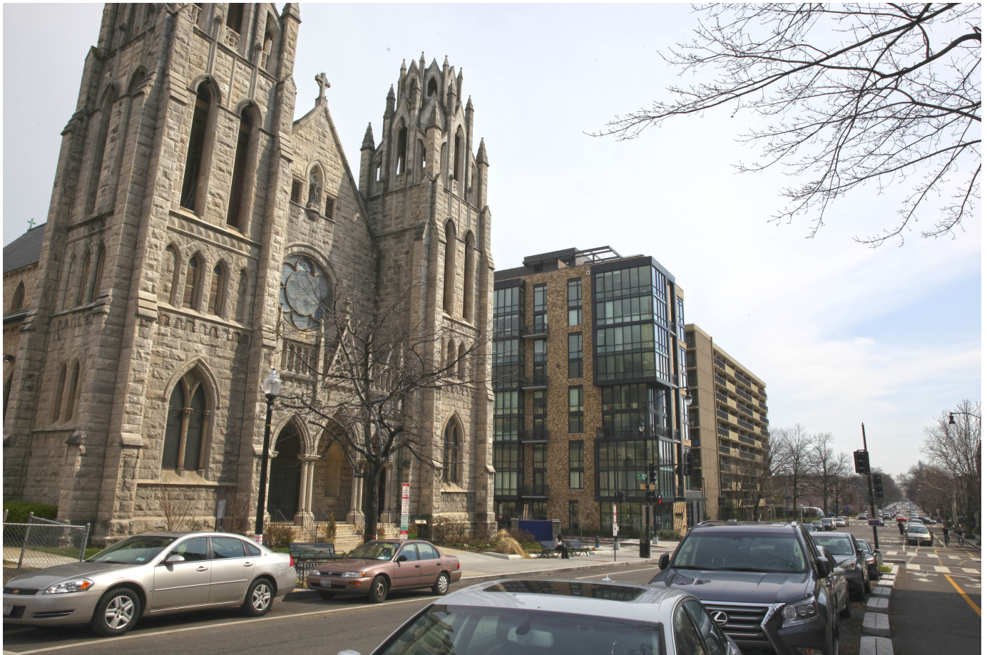
St. Augustine Catholic Church is near newer condominiums in Washington, D.C.

"I realized we couldn't wait for people to come to us. We had to go out to the community." The priest, now 77, was elected to a seat on the city's school board four years after the assassination and still remains well-connected in Washington's political and civic circles. He passes social justice lessons on at Georgetown University, where his popular class, "The Church and The Poor," helps students make sense of the Catholic social tradition by providing real life exposure to leading activists, civil rights attorneys and other community leaders in Washington.