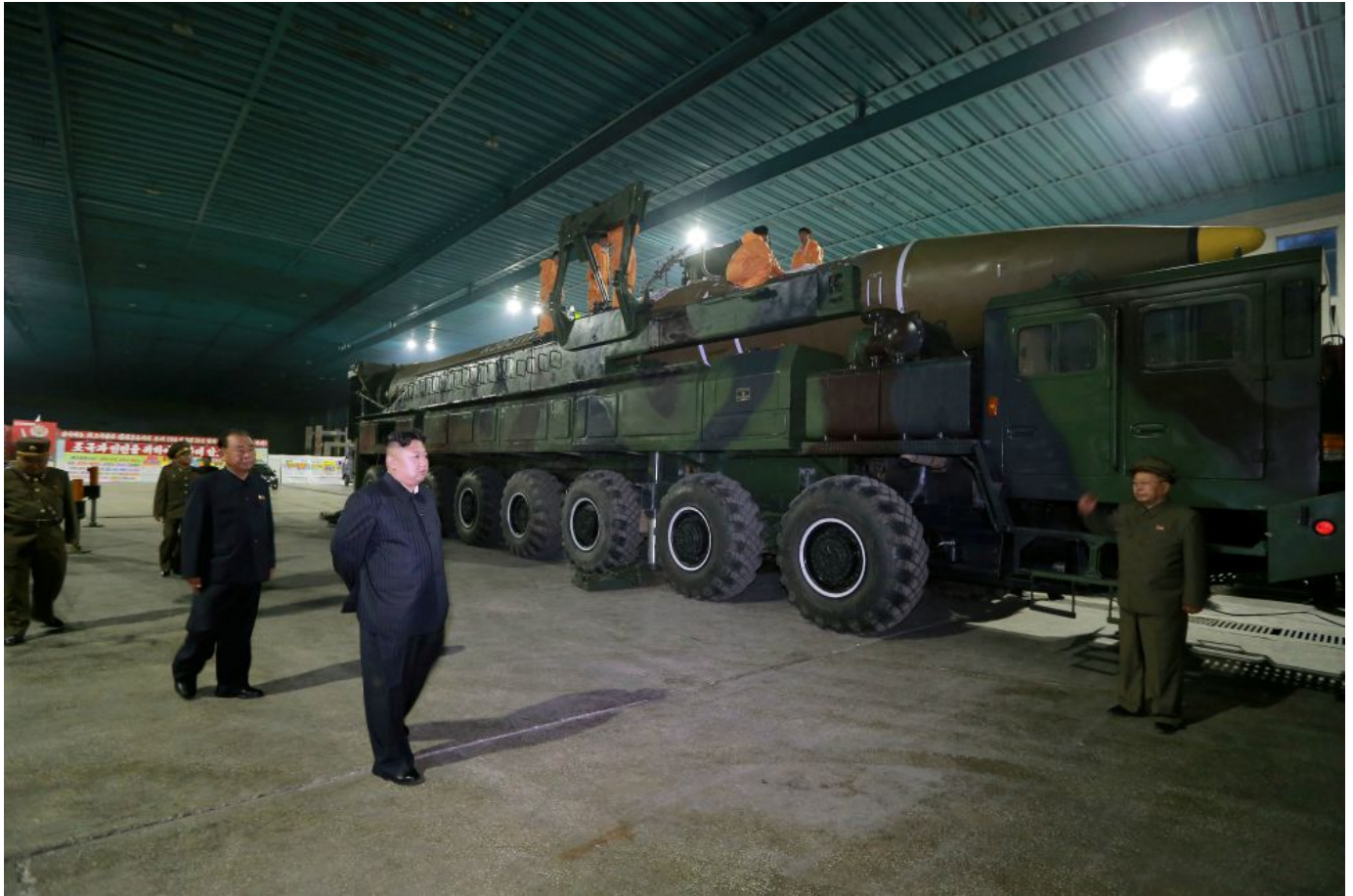
North Korean leader Kim Jong Un inspects the intercontinental ballistic missile Hwasong-14 in this undated photo released by North Korea's Korean Central News Agency.