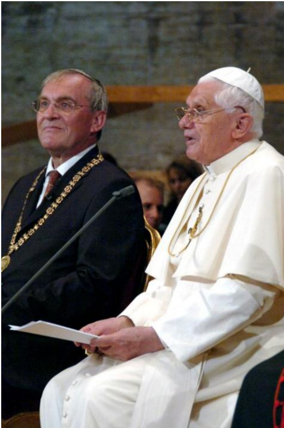
Pope Benedict XVI lectures on faith and reason at the University of Regensburg in Germany Sept. 12, 2006. A quotation from a Byzantine emperor that the pope used in this talk provoked outrage in the Muslim world, but the incident later led to increased dialogue with Muslims.