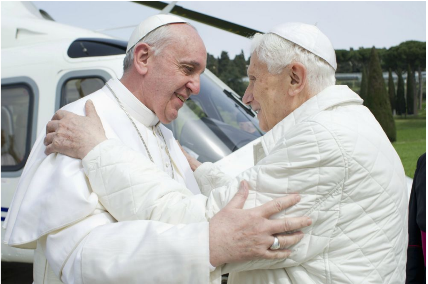
Pope Francis embraces emeritus Pope Benedict XVI at the papal summer residence in Castel Gandolfo, Italy, March 23, 2013. Pope Francis traveled by helicopter from the Vatican to Castel Gandolfo for a private meeting with the retired pontiff.

"The generosity, intelligence and integrity of Pope Benedict were crowned by his last papal act of courage and humility," she said. "His resignation."