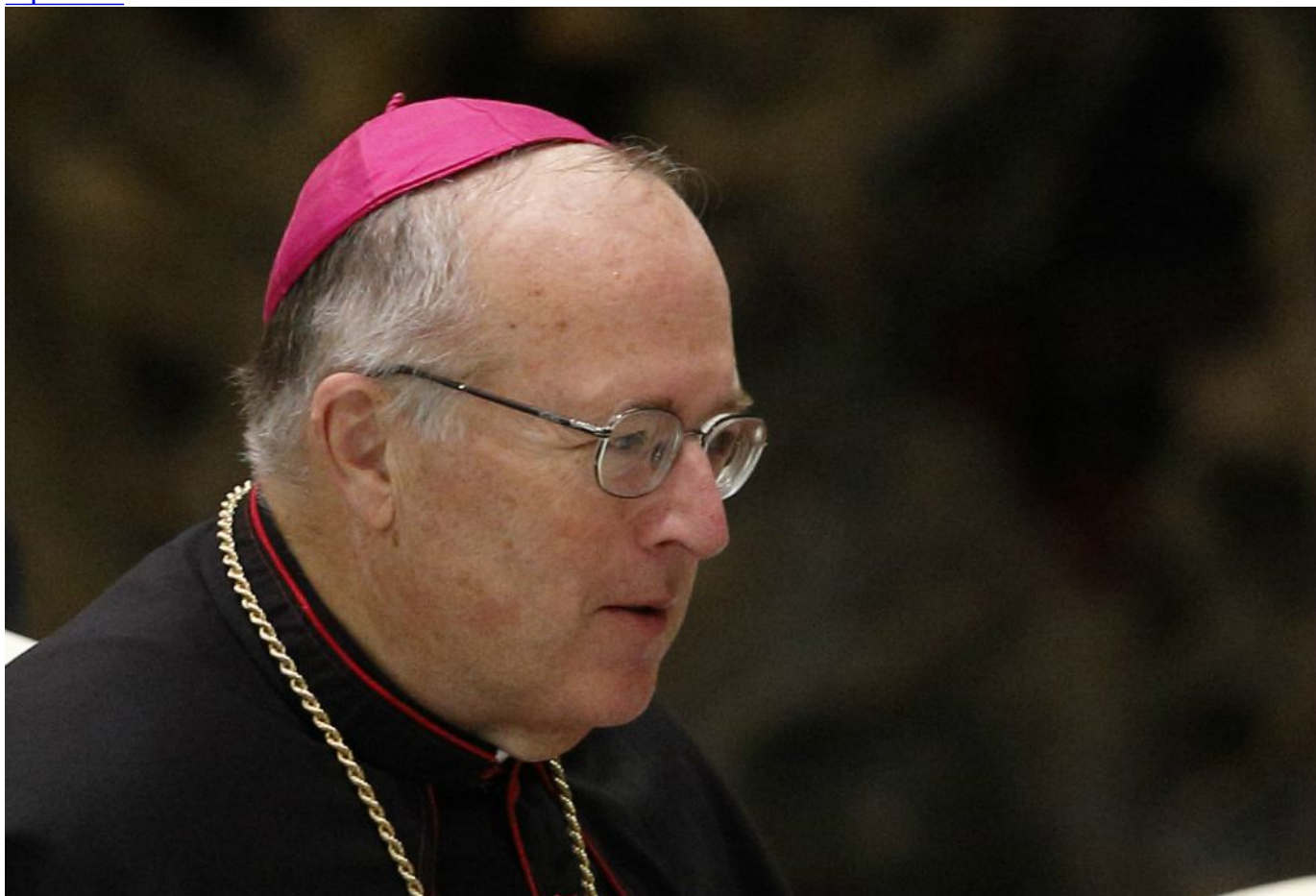
San Diego Bishop Robert McElroy pictured November 2016