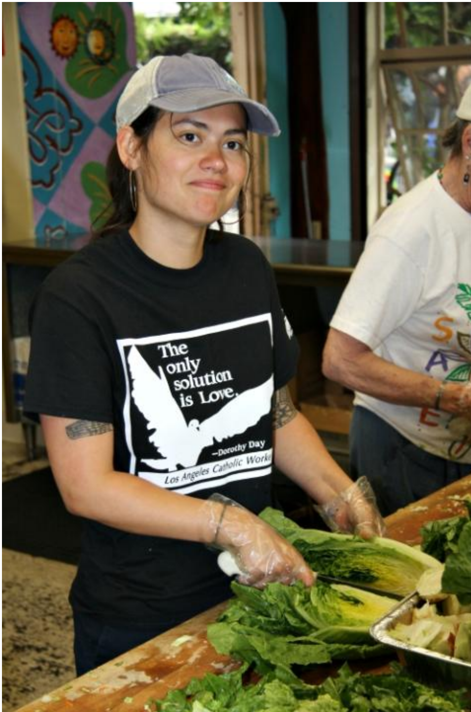
Food preparation at the Los Angeles Catholic Worker

However, even these communities don't make Catholicism a requirement for those who might like to join, and the movement resonates with non-Catholics as well.