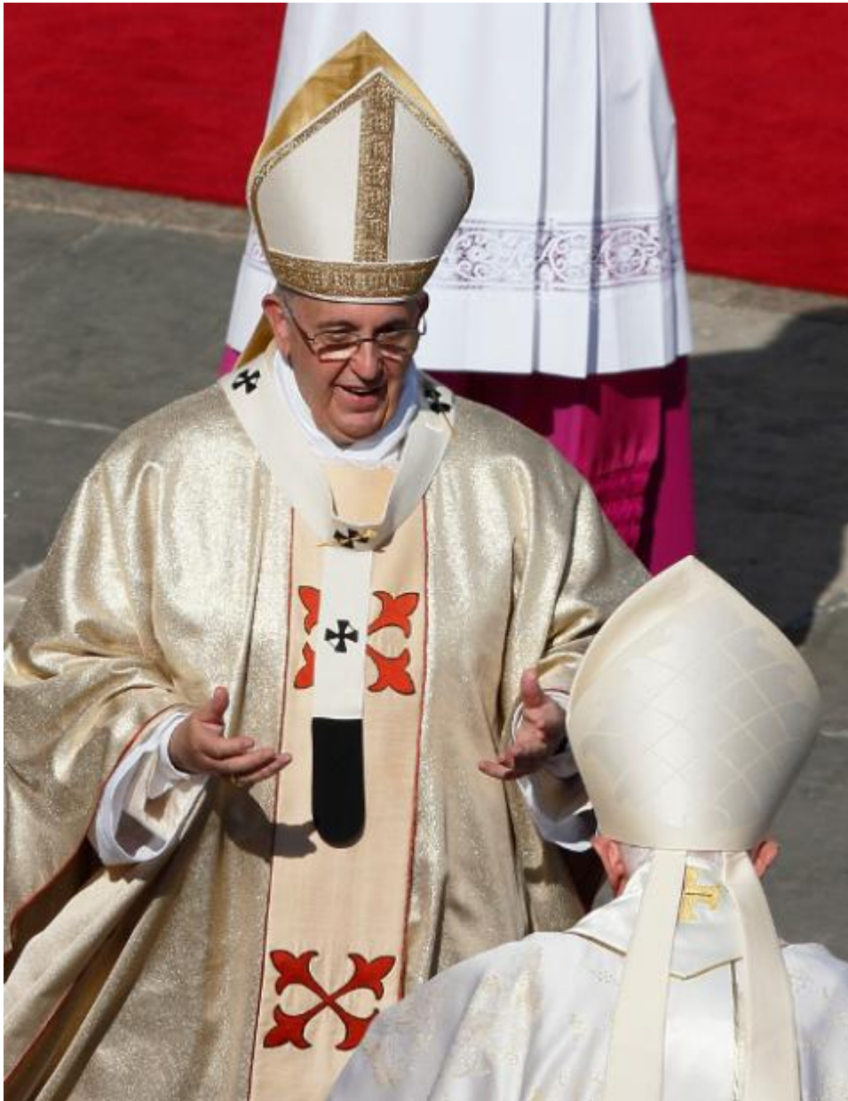
Pope Francis greets retired Pope Benedict XVI at the beatification Mass of Blessed Paul VI in St. Peter's Square at the Vatican Oct. 19, 2014.

taken up anew" and " 'the use of methods based on the laws of nature and the incidence of fertility' ( Humanae Vitae , 11) are to be promoted," it is " 'the parents themselves and no one else [who] should ultimately make this judgment in the sight of God' " ( Amoris Laetitia 222, quoting Gaudium et Spes , 50).