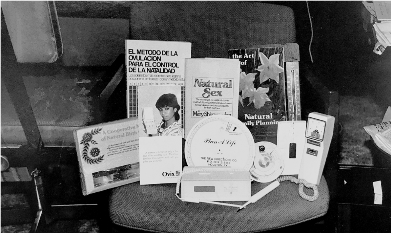
Natural family planning paraphernalia, circa 1983