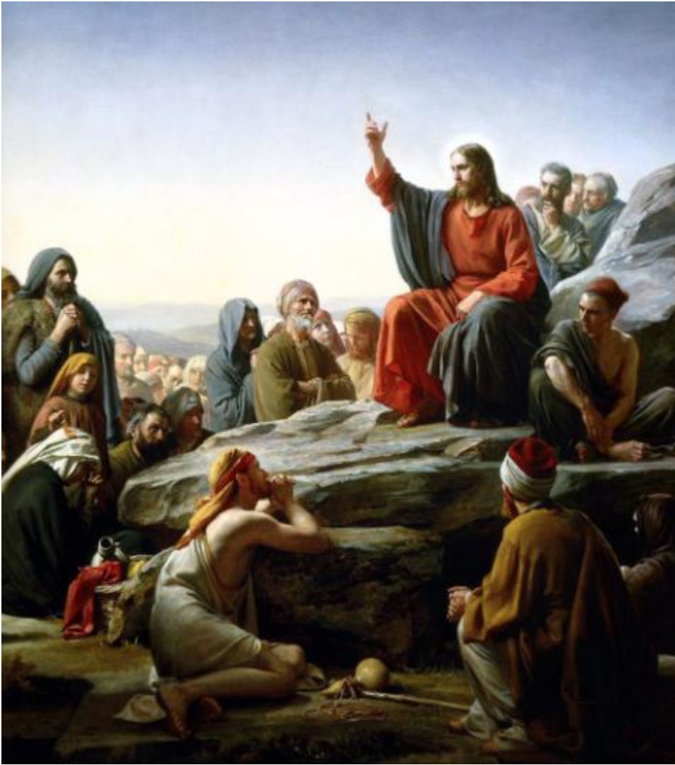
"The Sermon on the Mount" by Carl Bloch, created in 1877.