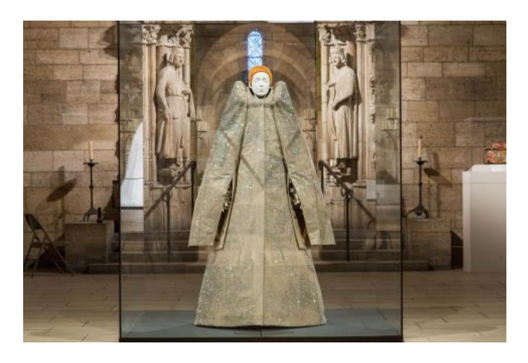
The Romanesque Hall at the Met Cloisters (The Metropolitan Museum of Art)

Bolton has said that "ostensibly the show is about Catholic imagery, but fundamentally it's about creativity and what drives creativity." I expect he has in mind the creativity of fashion. But a further chapter might also consider the creativity of the church inspired by the Holy Spirit. With its cornerstone in the Vatican Collection, "Heavenly Bodies" almost inevitably has an ultramontanist cast. (The popes chiefly represented are Leo XIII and, especially, Pius IX.)