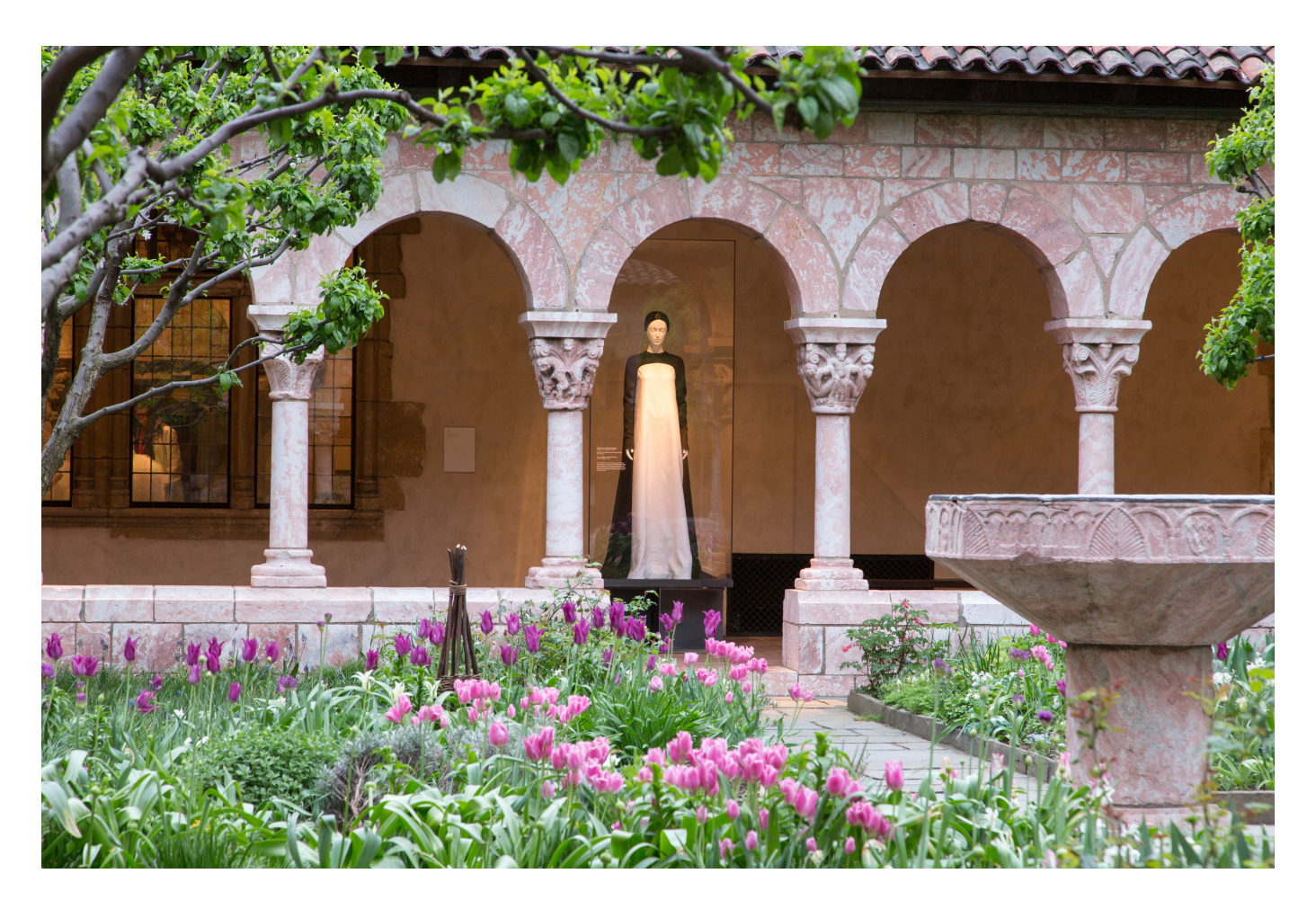
The Cuxa Cloister at the Met Cloisters in upper Manhattan (Metropolitan Museum of Art)

Two similarly columnar ensembles by Pierpaolo Piccioli for Valentino (2017-18) were inspired by the paintings of the 17th century Spanish master, Francisco de Zurbarán. Balenciaga, represented by an evening cape and a raincoat, is said also to have been influenced by Zurbarán, though he never himself claimed that. And for simple but luxurious elegance, almost nothing can match the cascading, hooded cape or two wide-sleeved evening dresses, one in black, the other light brown, by Madame Grès (from the 1960s).