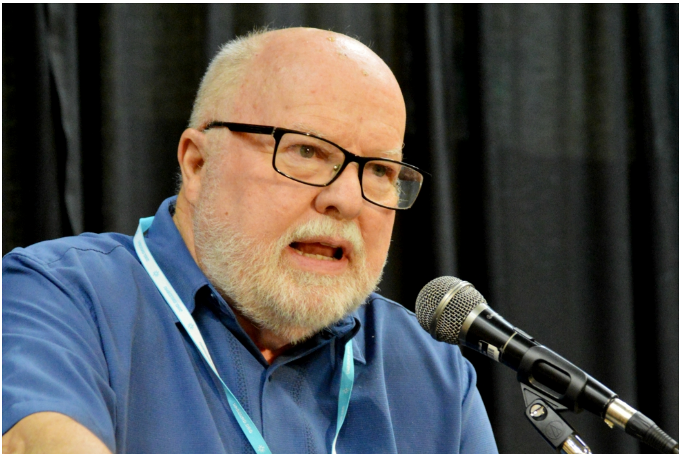
Franciscan Fr. Richard Rohr addresses the Association of U.S. Catholic Priests' annual Assembly June 26 in Albuquerque, New Mexico.

Franciscan Fr. Richard Rohr, a well-known author and lecturer on spirituality and contemplation, spoke to the assembly June 26 and led the group in a half-day retreat June 27.