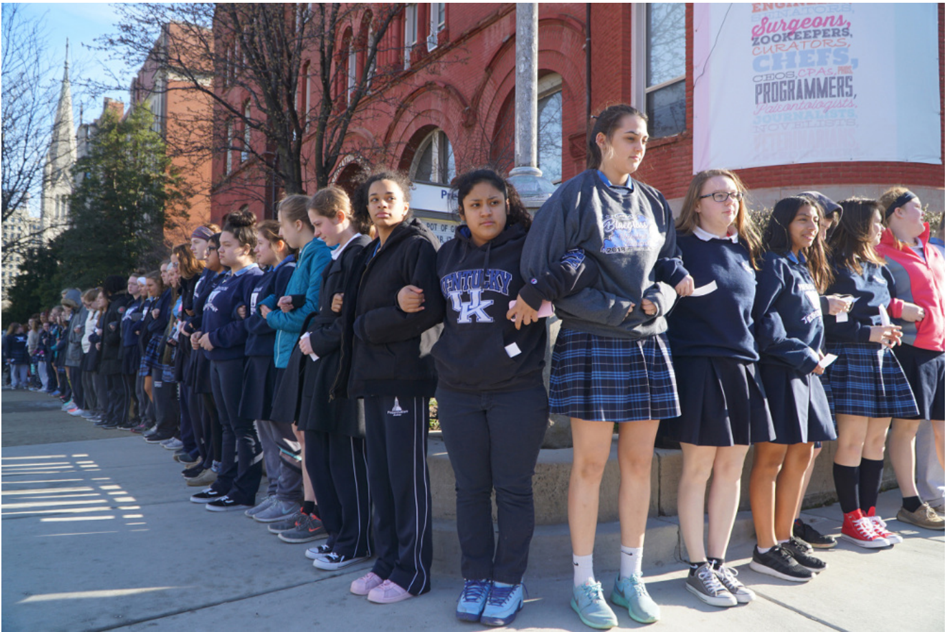
Presentation Academy students stand arm in arm on the sidewalk in downtown Louisville, Kentucky, after walking out of class March 14 to call attention to gun violence. (CNS/The Record/Marnie McAllister)

Catholic social ethics involves not only orthodoxy (right teaching) but also orthopraxis (right practice). The Catholic tradition thus has to be concerned with the concrete ways of overcoming injustice and making justice, peace, and the integrity of creation more prevalent in our local, national, and global realities. Today moral theologians are more conscious of their responsibilities in this area of bringing about social change through more than just teaching what is right or wrong.