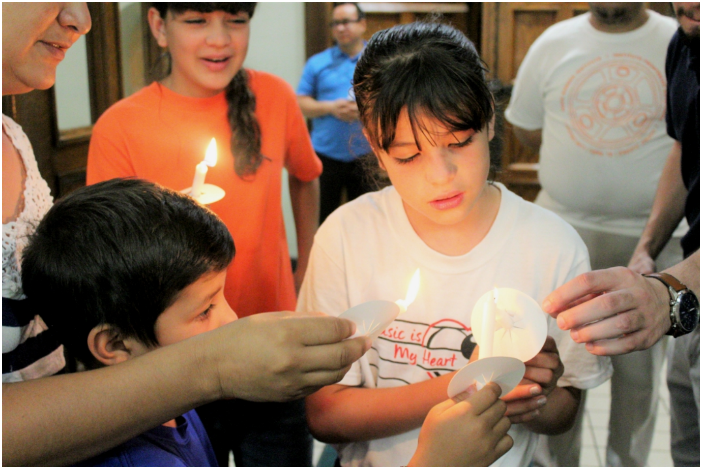
Guided by parents, children light candles during the July 20 service at St. Patrick Cathedral in El Paso, Texas.

Many of the July 21 teach-in attendees already accompany migrants in some capacity. Some volunteer at temporary shelters, visit the detained or are involved in a parish ministry. Yet they need support in doing what is viewed as "countercultural."