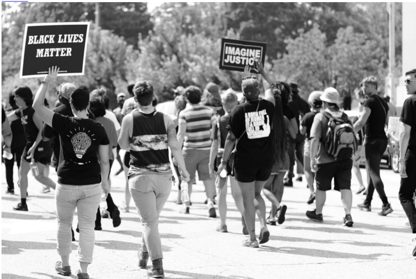
Participants at a 2017 Black Lives Matter demonstration in St. Louis. (Kristen Trudo)