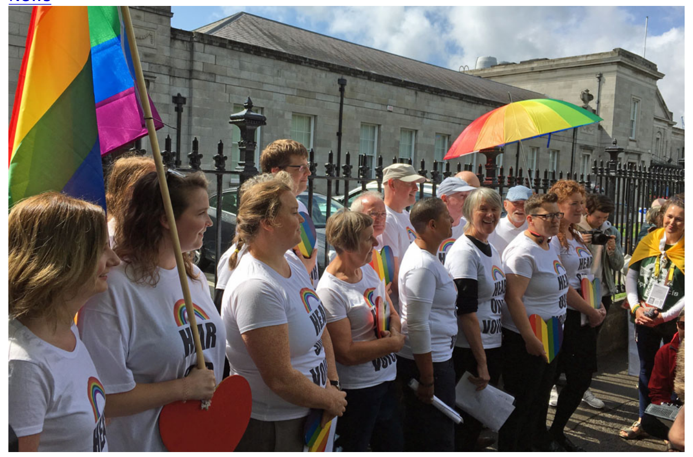
An LGBT choir outside the gates of the World Meeting of Families, Thursday Aug. 23 in Dublin