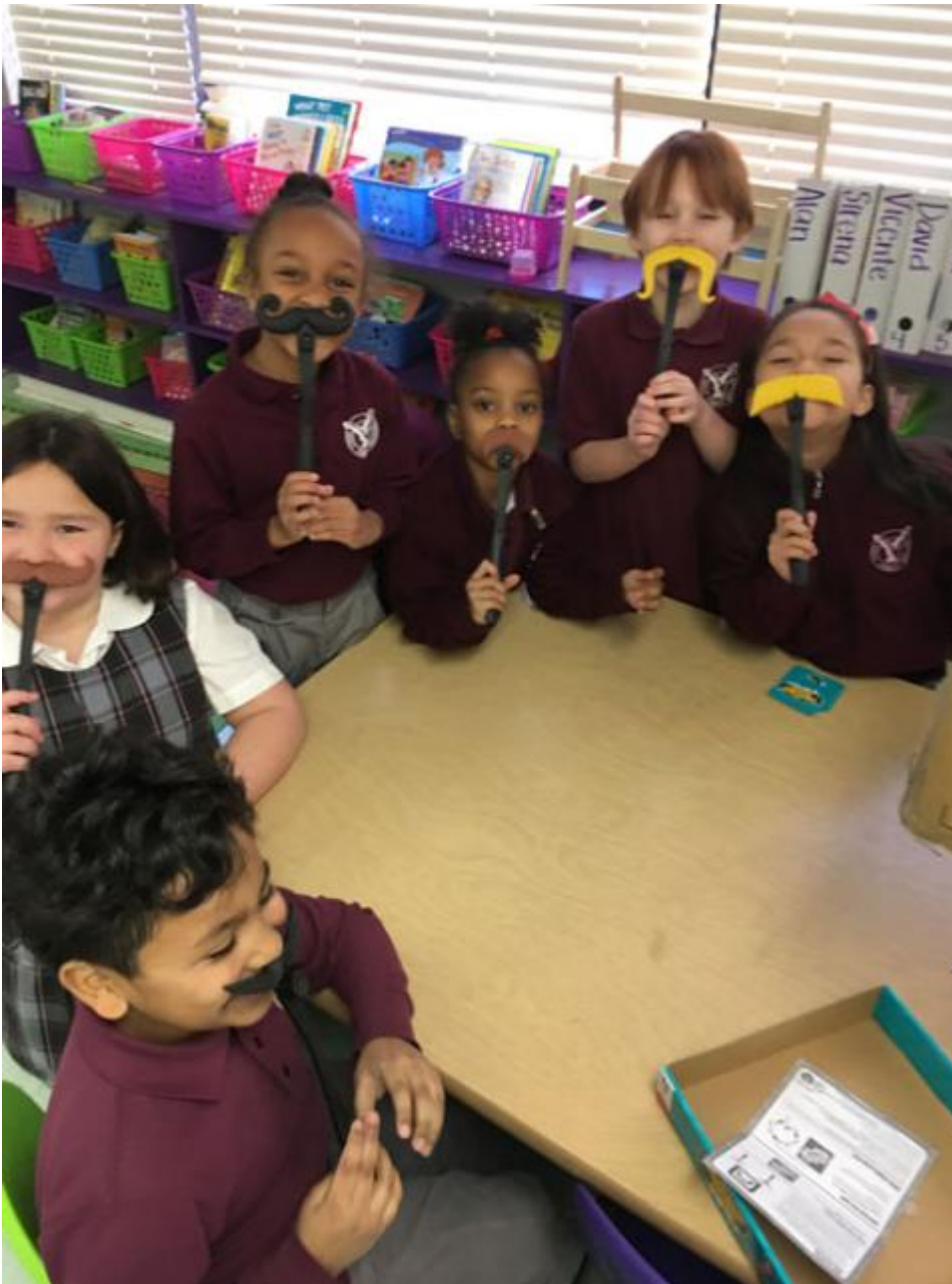
Students at Holy Family School in 2017

Another growth spurt followed the 1960 opening of NASA's Marshall Space Flight Center. Thousands of educated young families flocked to Huntsville, attracted by the region's abundant job opportunities. The Huntsville school system struggled to keep pace with this influx, opening 21 buildings over a 15-year span. Despite these new facilities, schools remained crowded. Some children attended split sessions while others occupied portable classrooms.