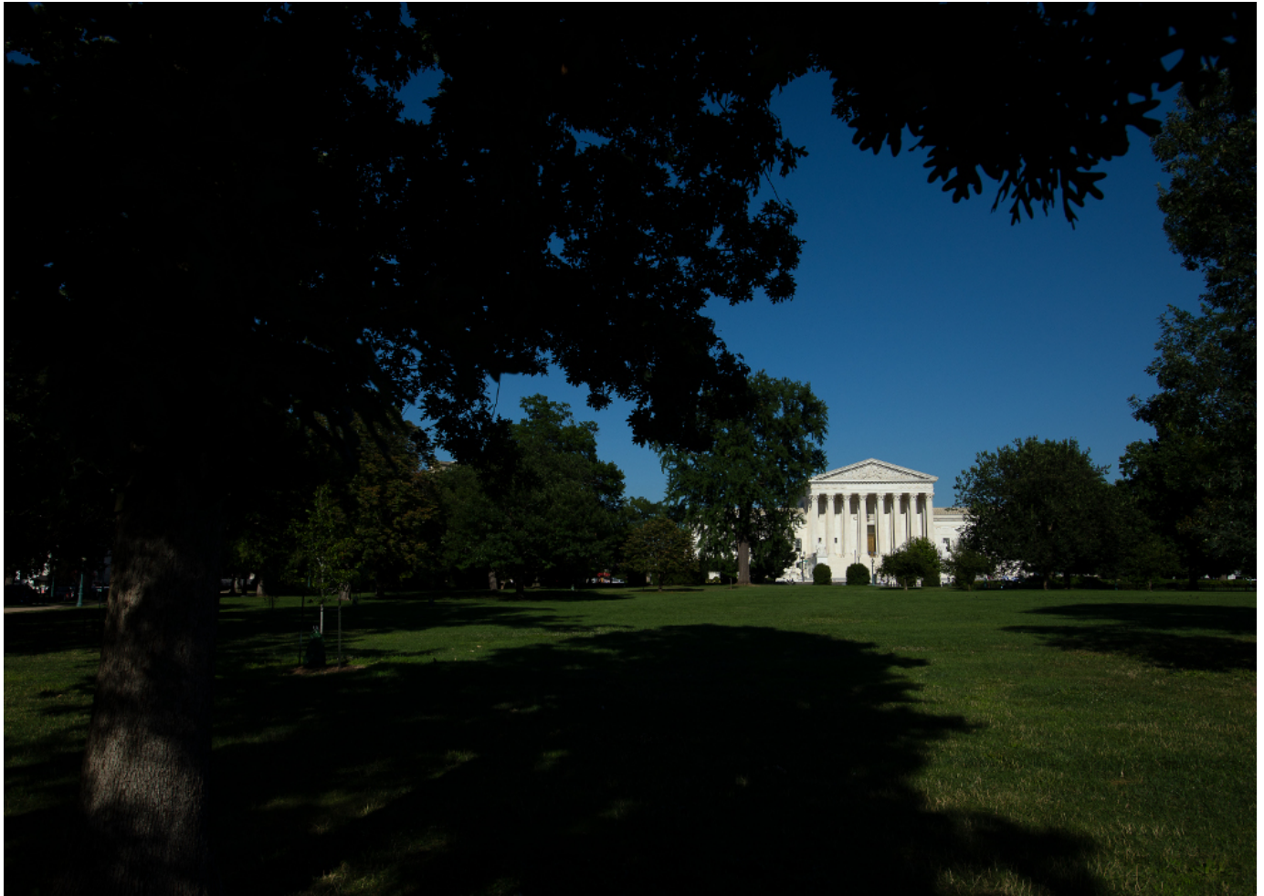
U.S. Supreme Court