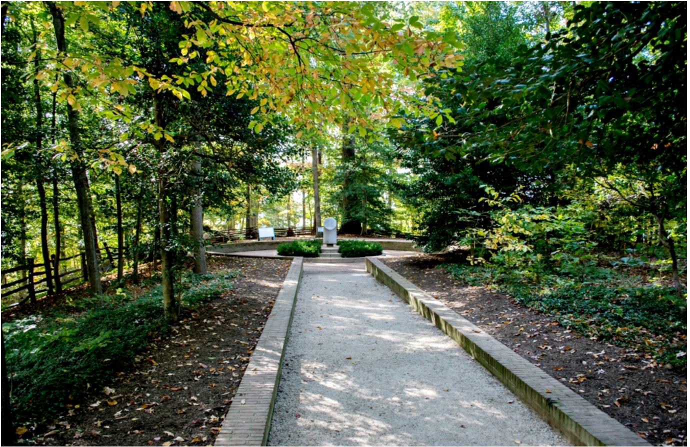
The slave burial ground and Slave Memorial at Mount Vernon, Virginia, the home of George Washington

I had long recognized that to credit any moral superiority to George Washington over his decision to free his slaves upon his death, over against Thomas Jefferson's failure to do so, overlooked a key historical fact: In 1794, Eli Whitney received a patent for his cotton gin. At the end of the 18th century, with the decline of the tobacco industry, slaves were becoming more of a burden than an asset. As the use of the cotton gin became widespread, the value of slaves needed to harvest cotton restored their value. Washington did not realize how valuable his slaves were when he wrote his will. Jefferson did when he wrote his.