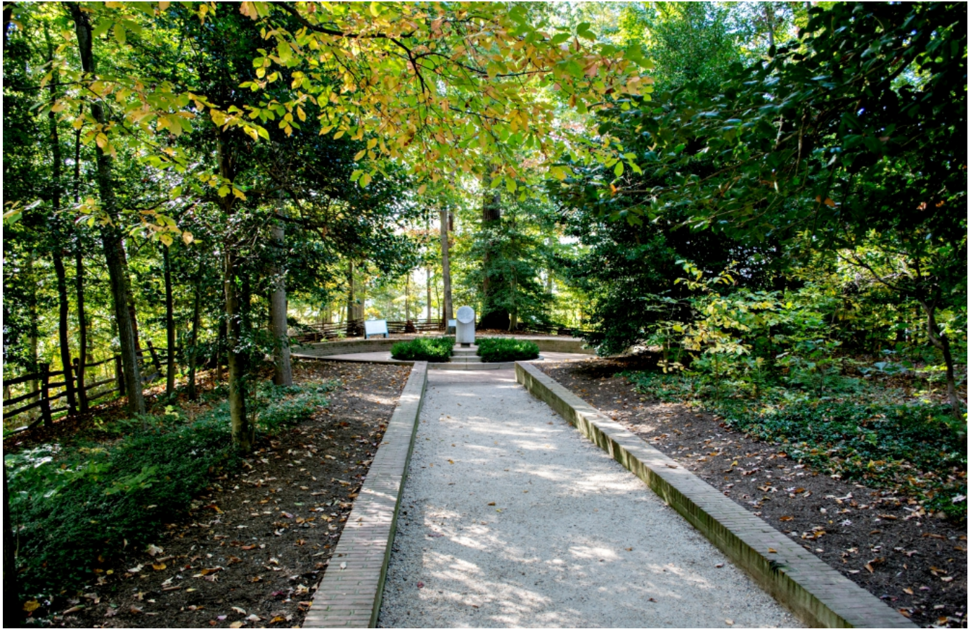
The slave burial ground and Slave Memorial at Mount Vernon, Virginia, the home of George Washington

I had long recognized that to credit any moral superiority to George Washington over his decision to free his slaves upon his death, over against Thomas Jefferson's failure to do so, overlooked a key historical fact: In 1794, Eli Whitney received a patent for his cotton gin. At the end of the 18th century, with the decline of the tobacco industry, slaves were becoming more of a burden than an asset. As the use of the cotton gin became widespread, the value of slaves needed to harvest cotton restored their value. Washington did not realize how valuable his slaves were when he wrote his will. Jefferson did when he wrote his.