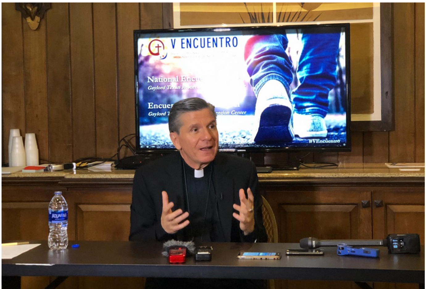
Archbishop Gustavo García-Siller speaks with the media Sept. 21 in Grapevine, Texas during the National V Encuentro.

García-Siller noted that the group of young people he dined with already disrupted the stereotypes he might have had.