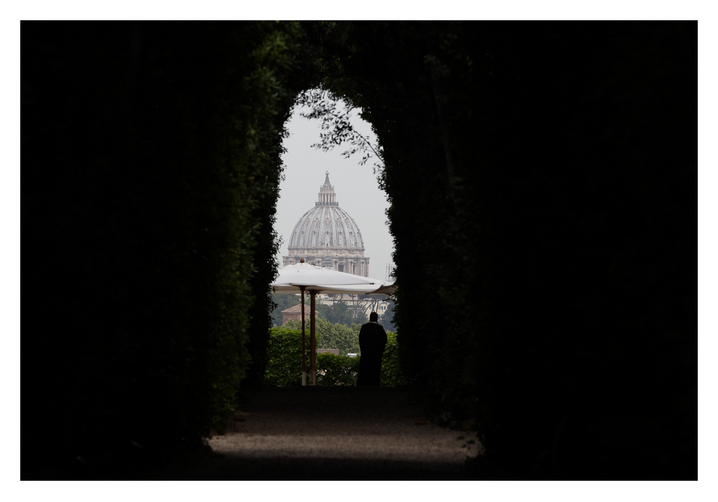
The dome of St. Peter's Basilica at the Vatican is seen from the Aventine Hill in Rome.

In a classic case of market overreach, the indulgences debacle was key to disaster and led to the Church-in-Rome's losing the Catholic Church's dominion in Northern Europe. Rome had now lost most of its 400 southern Mediterranean dioceses to Islam, "lost" the Eastern Christian Church to Constantinople, and lost Northern Europe to Luther and Protestantism. Today's losses in the Northern and Southern hemisphere are too much in the news to need discussing here.