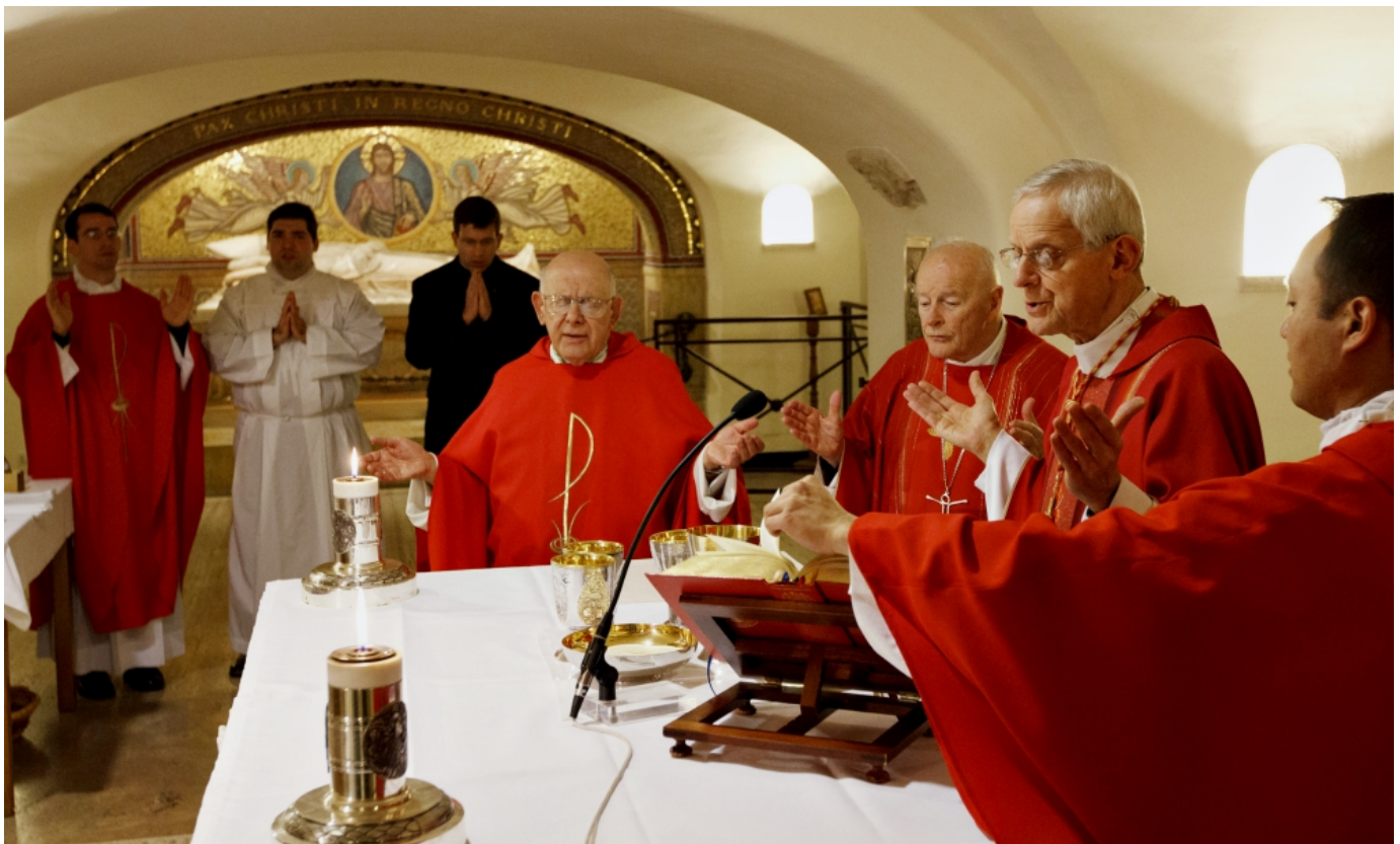
U.S. bishops, including then-Cardinal Theodore McCarrick (third from right), celebrate the Eucharist in the crypt of St. Peter's Basilica during their January 2012 "ad limina" visits to the Vatican.