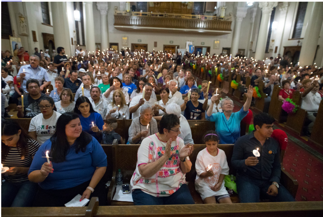
Worshippers attend a candlelight vigil July 20 at St. Patrick's Cathedral in El Paso, Texas, following an immigration march and rally.