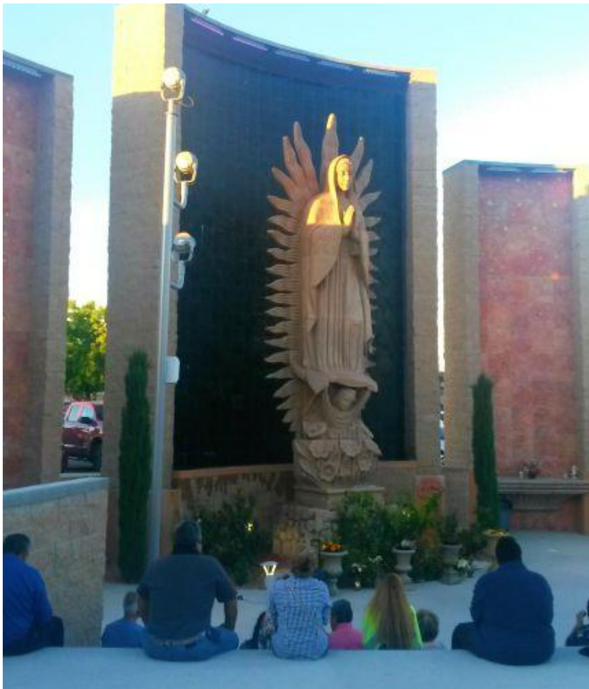
People say the rosary near a fountain representing the Virgin Mary at St. Mark Catholic Church in El Paso, Texas, Sept. 17.