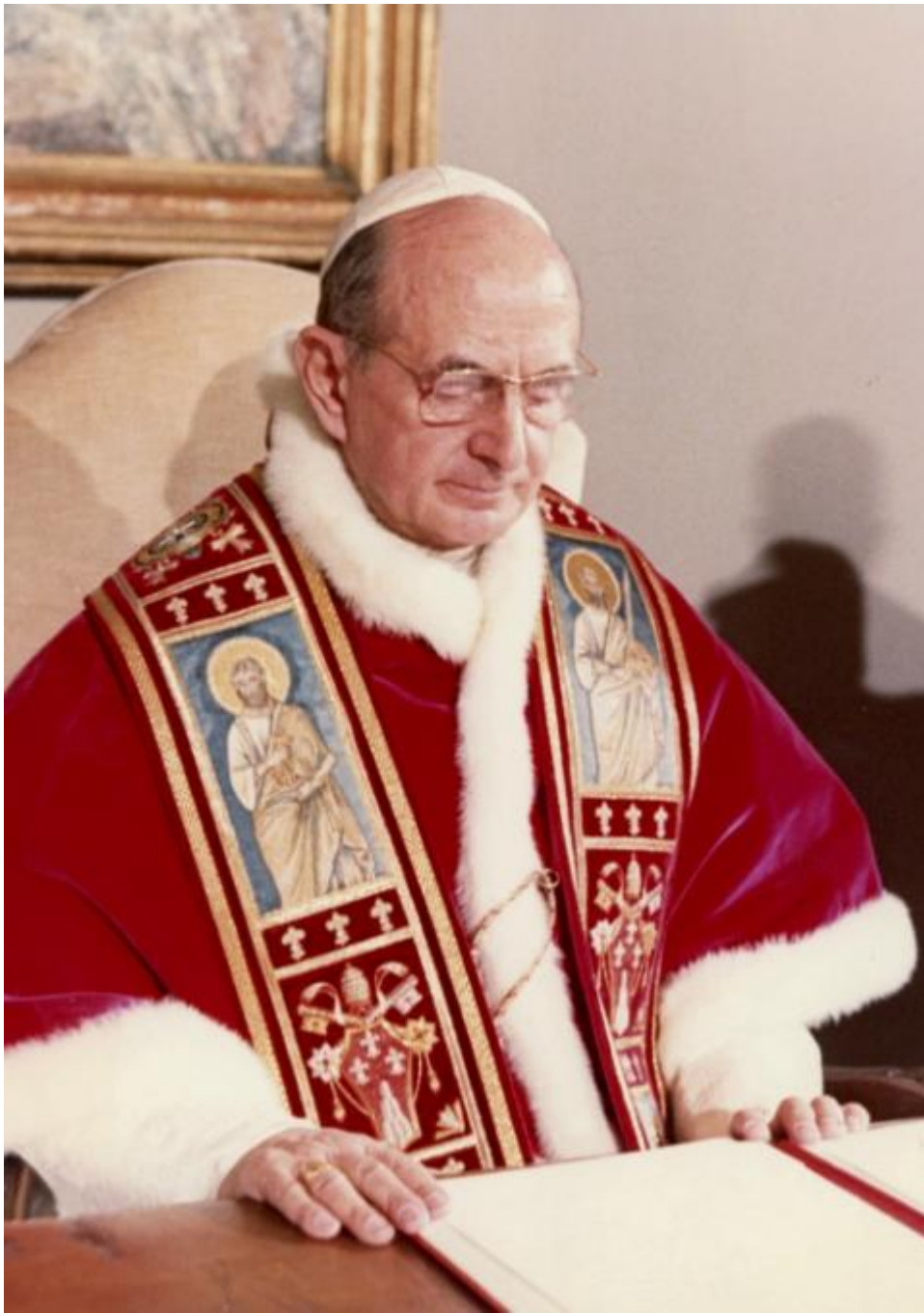
Pope Paul VI at the Vatican on June 29, 1968

"The American Catholic community experienced a very similar, and seemingly equally quick, disappearance of a revered theological system after 1968," Massa writes. "What passed from the scene was, as in the earlier case, a rigorously systematic, even logical, theological system, which has been traditionally labeled 'neo-scholastic natural law.' "